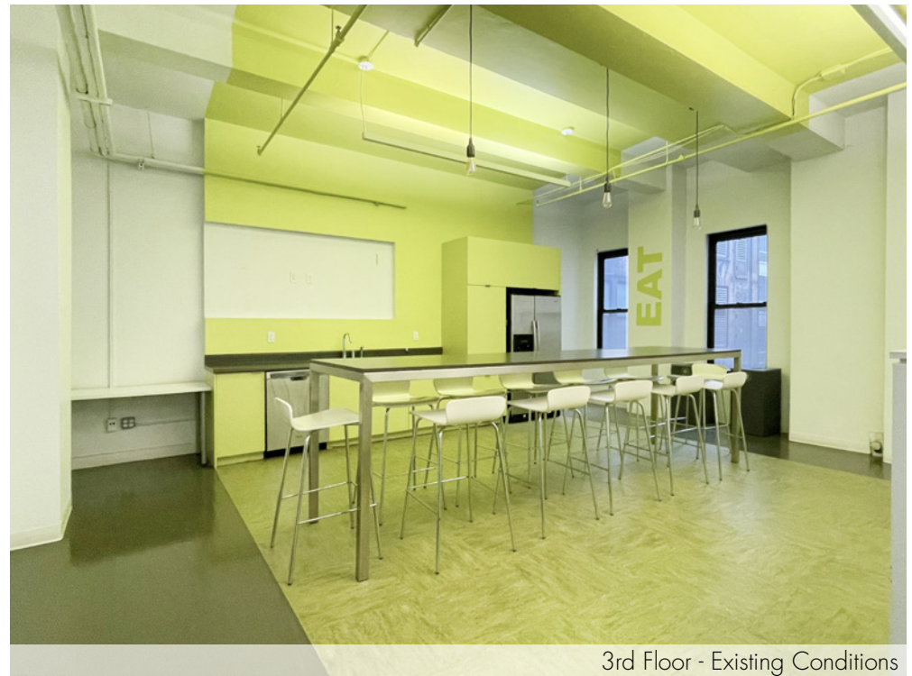
3rd Floor - Existing Conditions