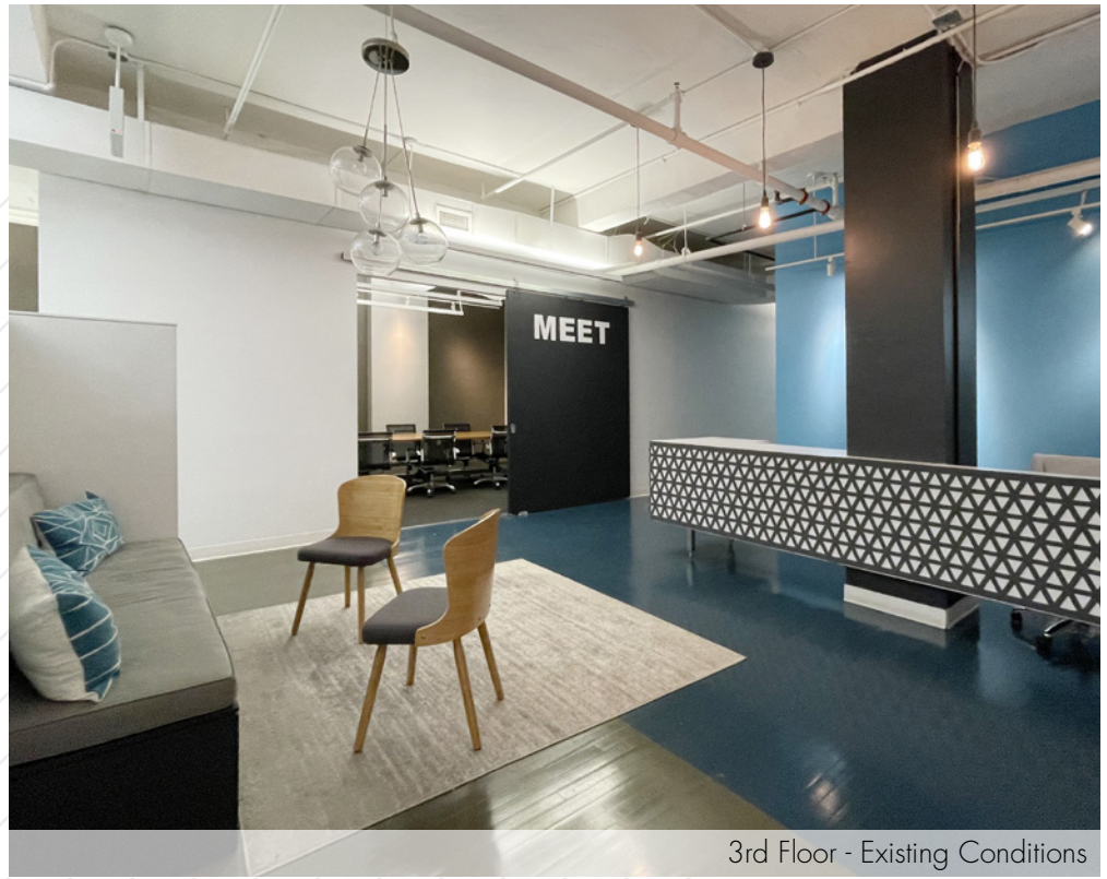
3rd Floor - Existing Conditions