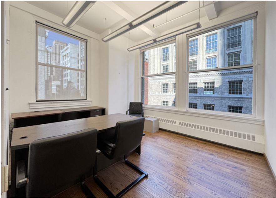
Corner Executive Office