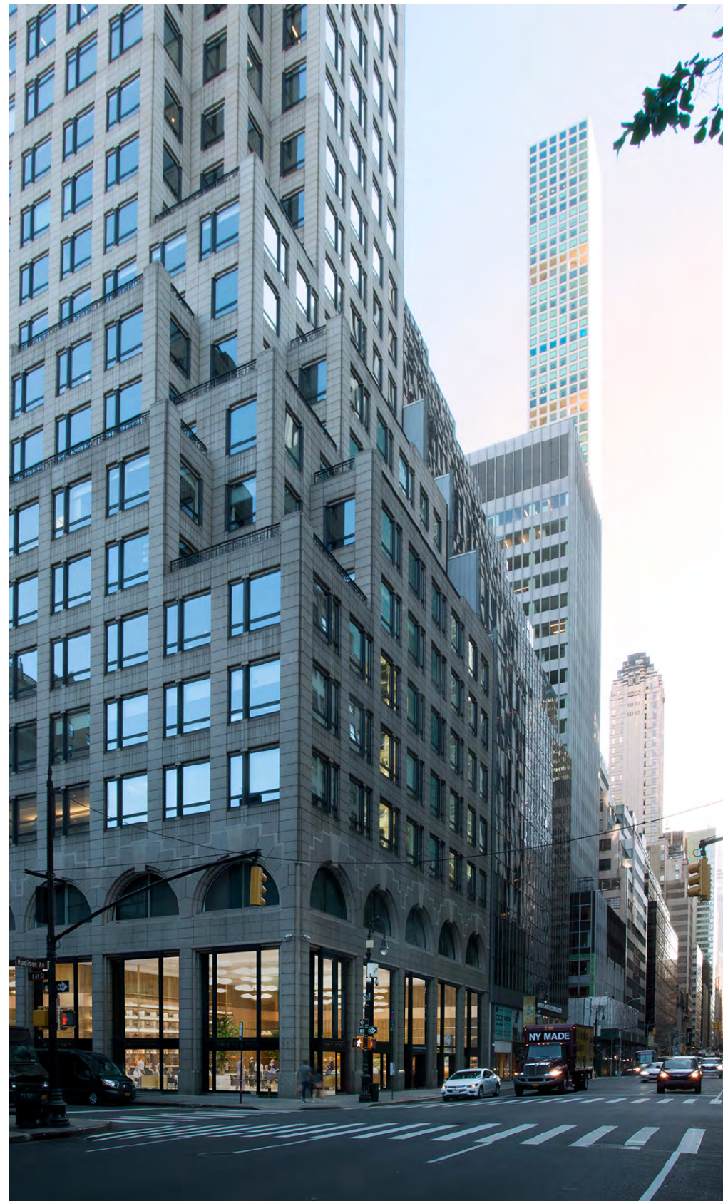
Building Northwest Corner