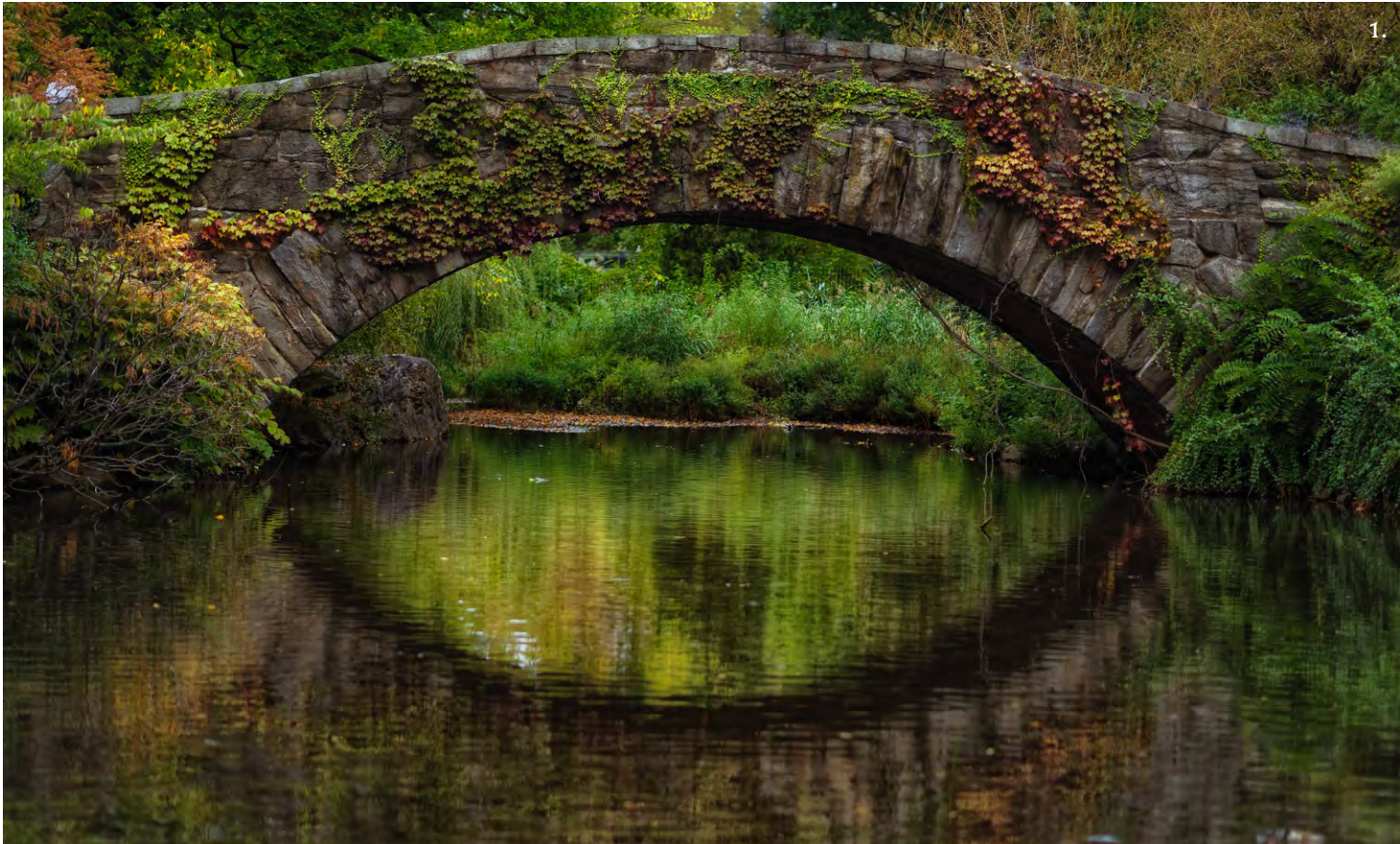
1. Gapstow Bridge, Central Park 2. Central Park lawn 3. The Guggenheim 4. Metropolitan Museum of Art