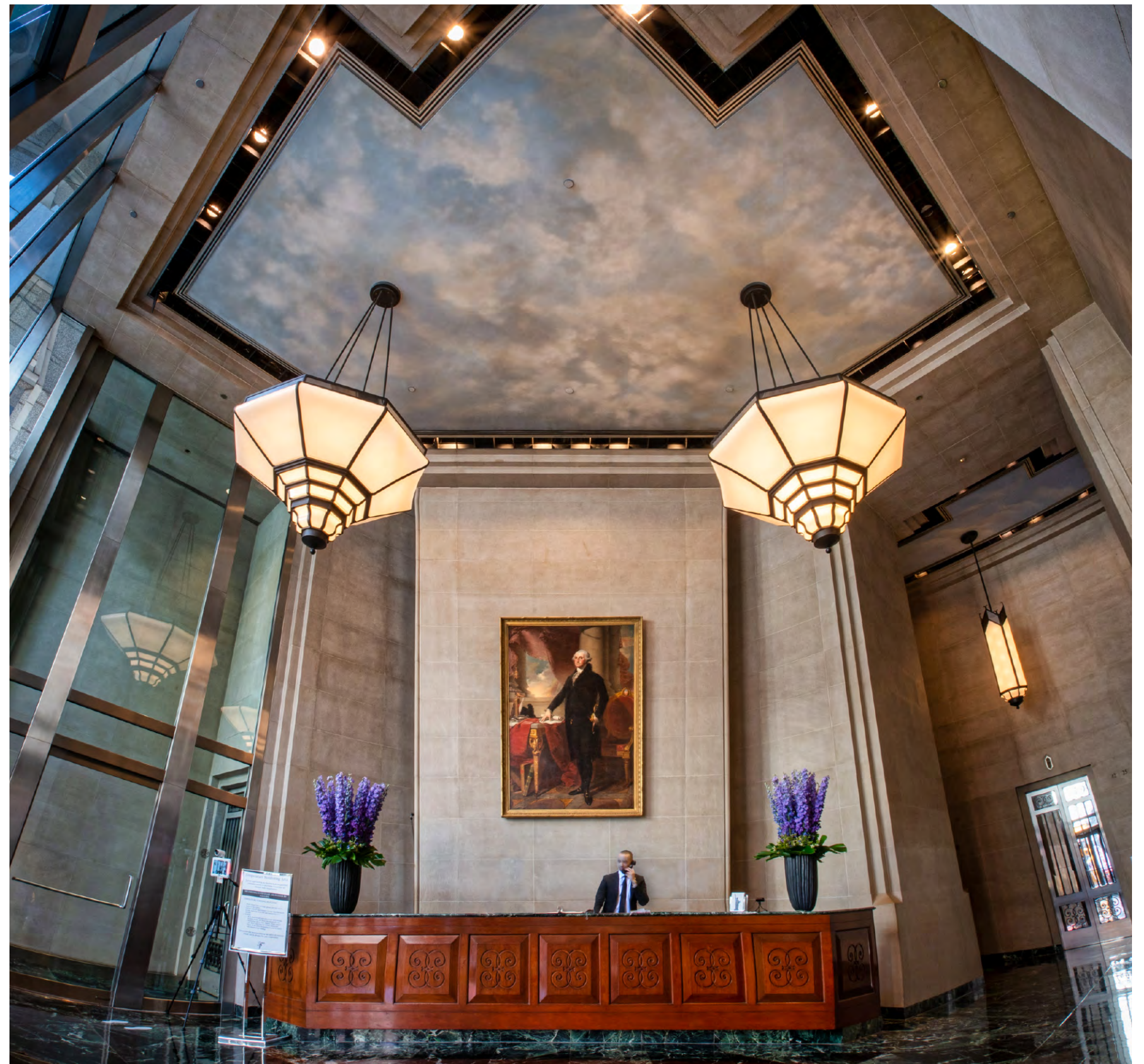
The Munro-Lenox Portrait of George Washington