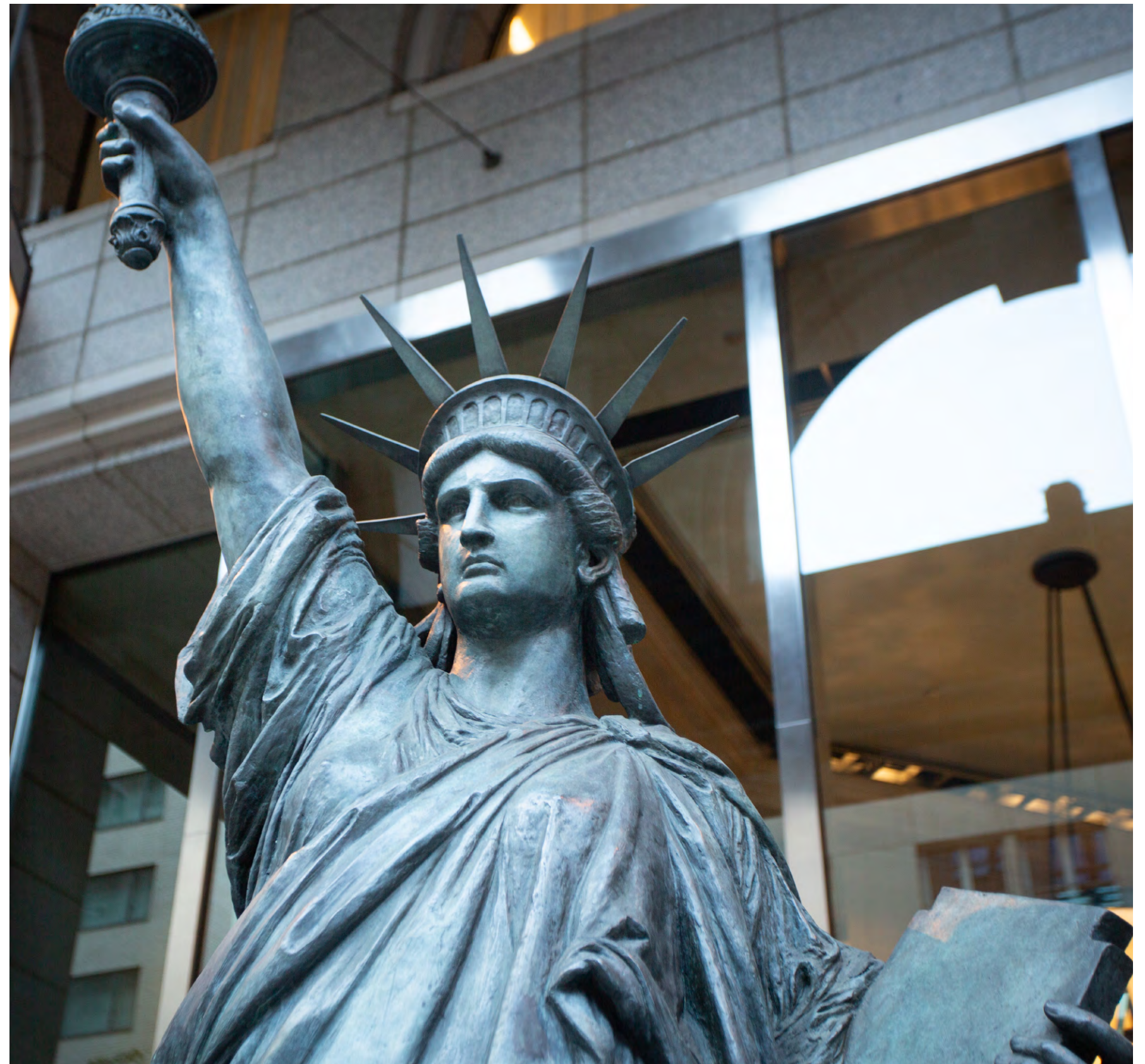
A ten-foot-tall bronze Statue of Liberty, by Frédéric Auguste Bartholdi

Elevators have been pre-programmed to accommodate "express ride" from any floor directly to the lobby, and lobby attendants can arrange private car service to any floor in the building upon request.