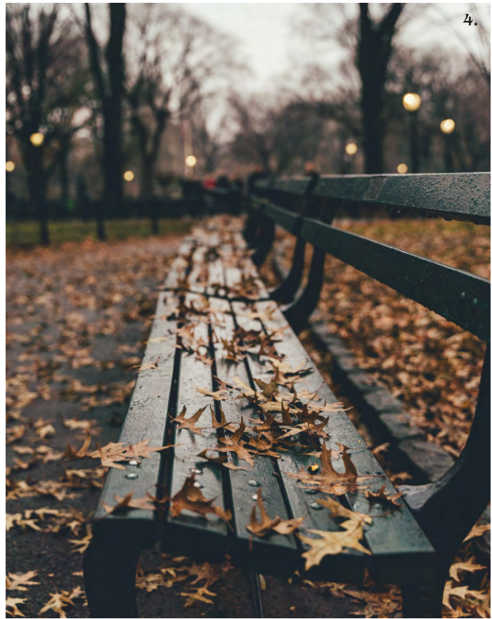
1. Gapstow Bridge, Central Park 2. Museum of Modern Art 3. Gucci, Fifth Avenue 4. Central Park