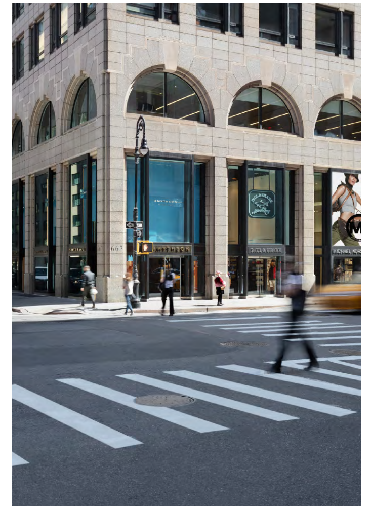
Corner of Madison Avenue and 61st Street