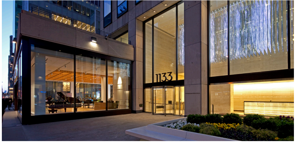
LANDSCAPED ENTRY PLAZA