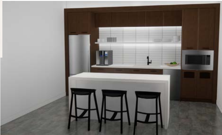
*EXAMPLE PANTRY FOR FINISHES ONLY