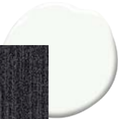
POLISHED CON-CRETE FLOORING: THROUGH OUT OPEN AREAS AND PANTRY