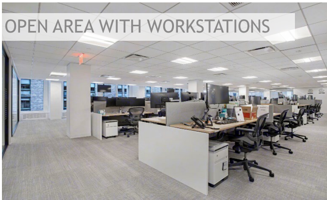
OPEN AREA WITH WORKSTATIONS