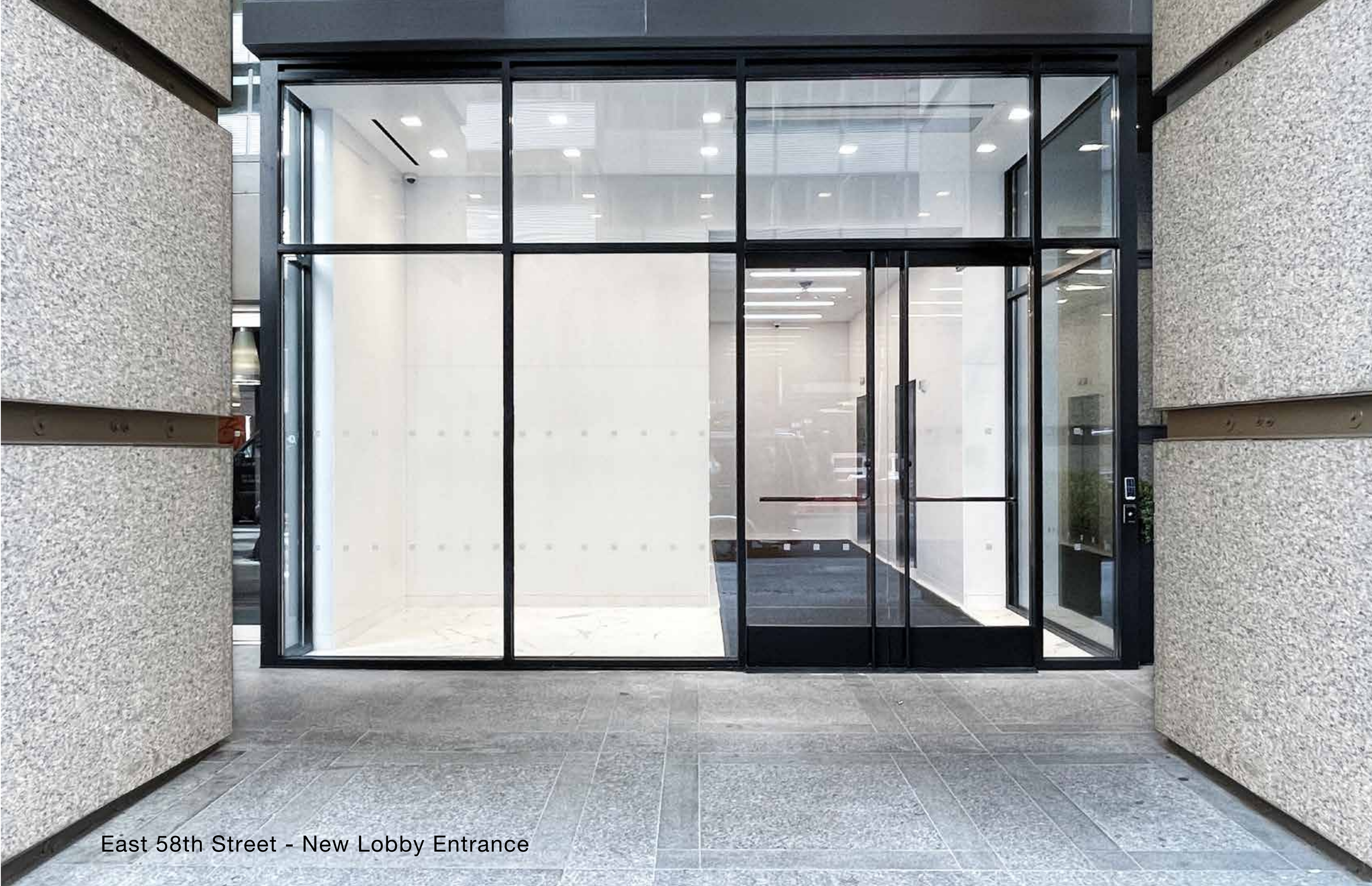
East 58th Street - New Lobby Entrance