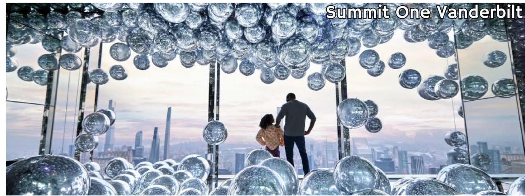
Summit One Vanderbilt