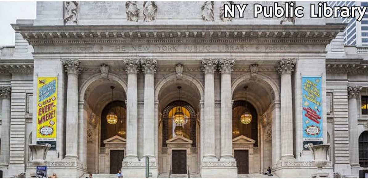
NY Public Library