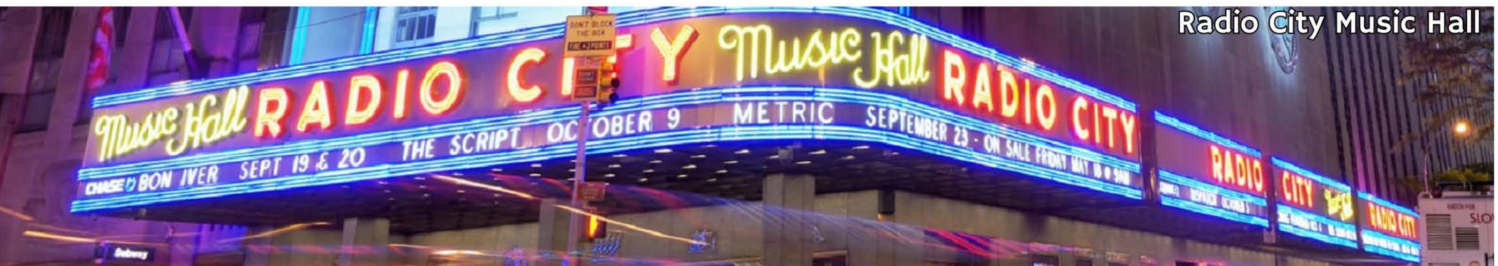
Radio City Music Hall