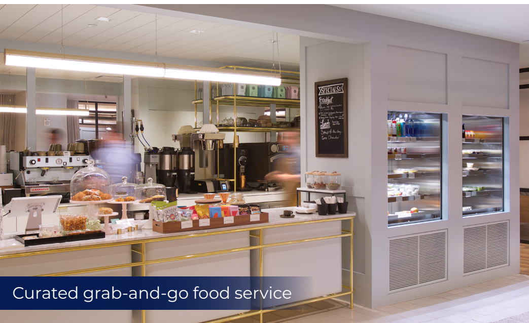
Curated grab-and-go food service