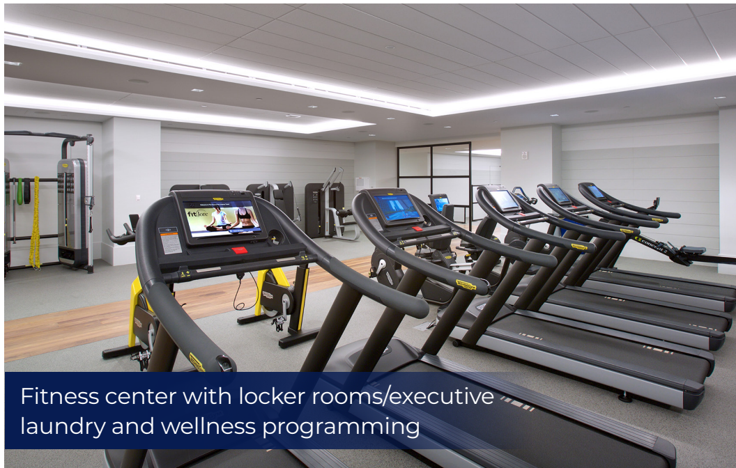
Fitness center with locker rooms/executive laundry and wellness programming