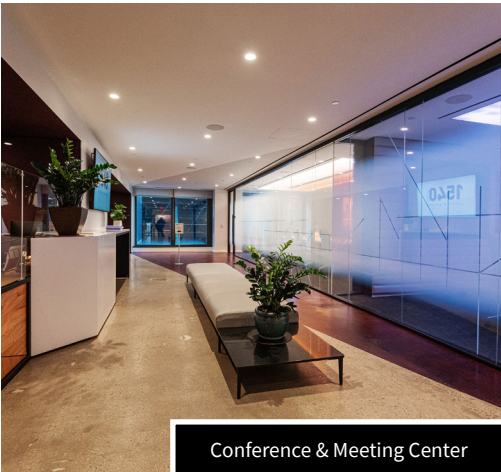
Conference & Meeting Center