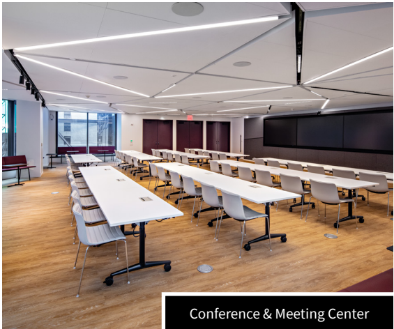
Conference & Meeting Center