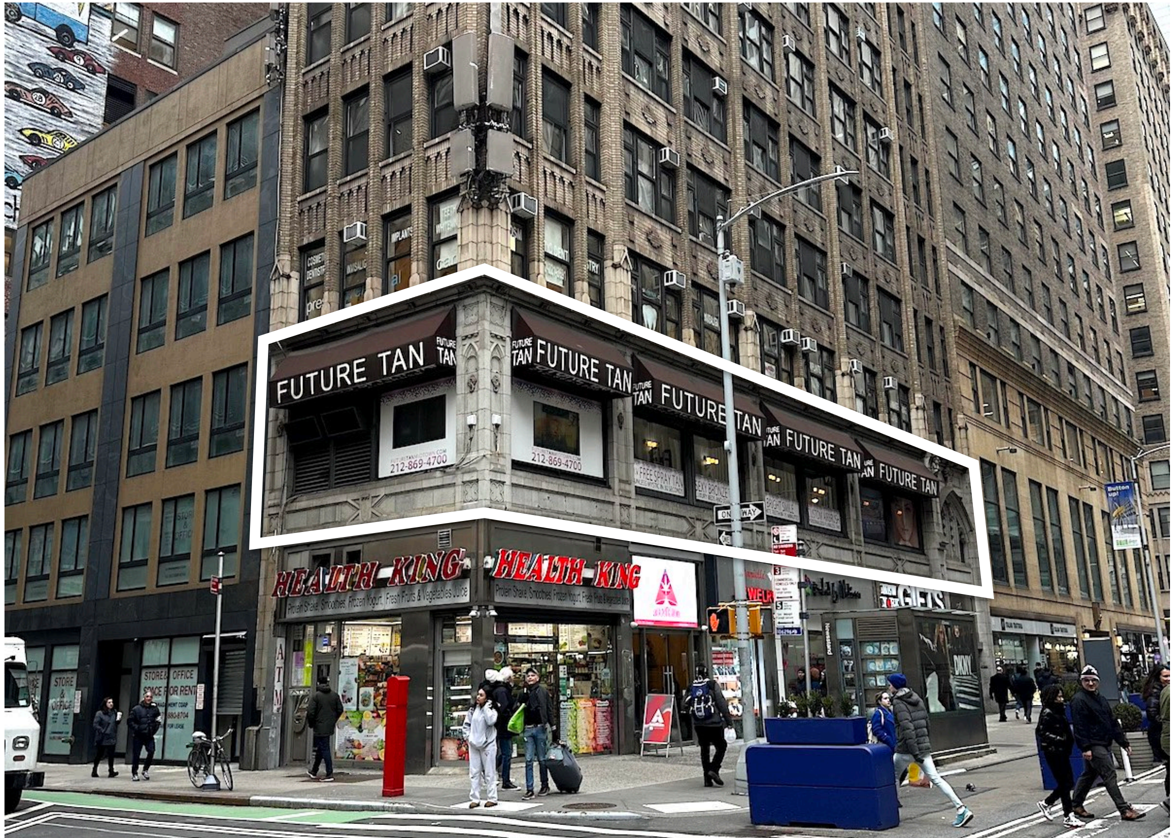
ABOVE-GRADE RETAIL SPACE