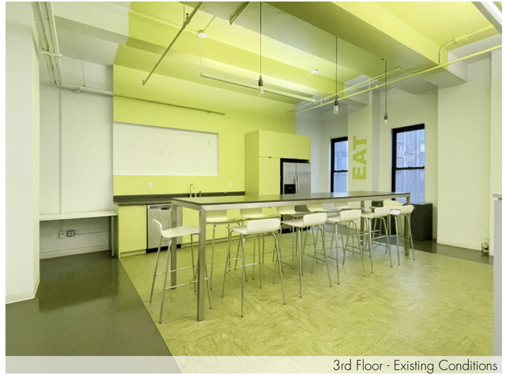
3rd Floor - Existing Conditions