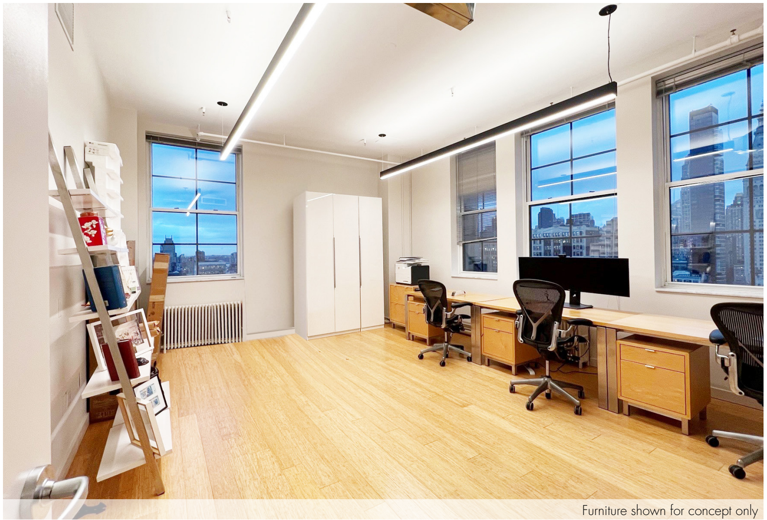
Furniture shown for concept only