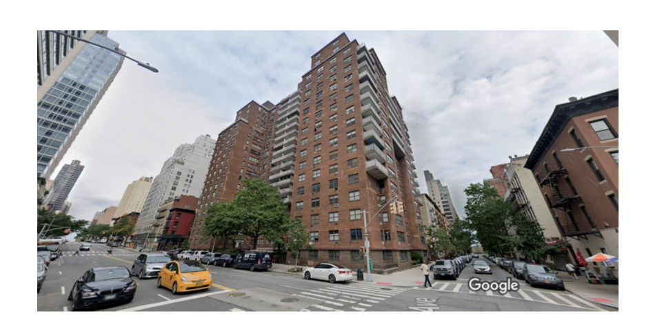
Building Exterior Street View