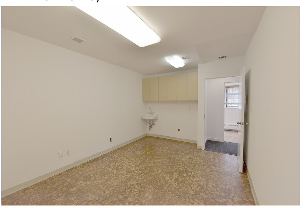
Office / Exam room