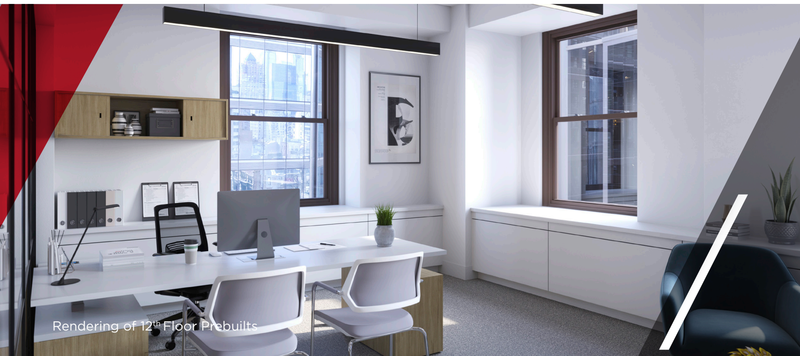
Rendering of 12 th Floor Prebuilds