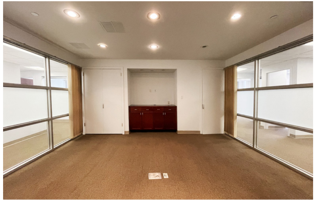
Entire 6th Floor Conference Room