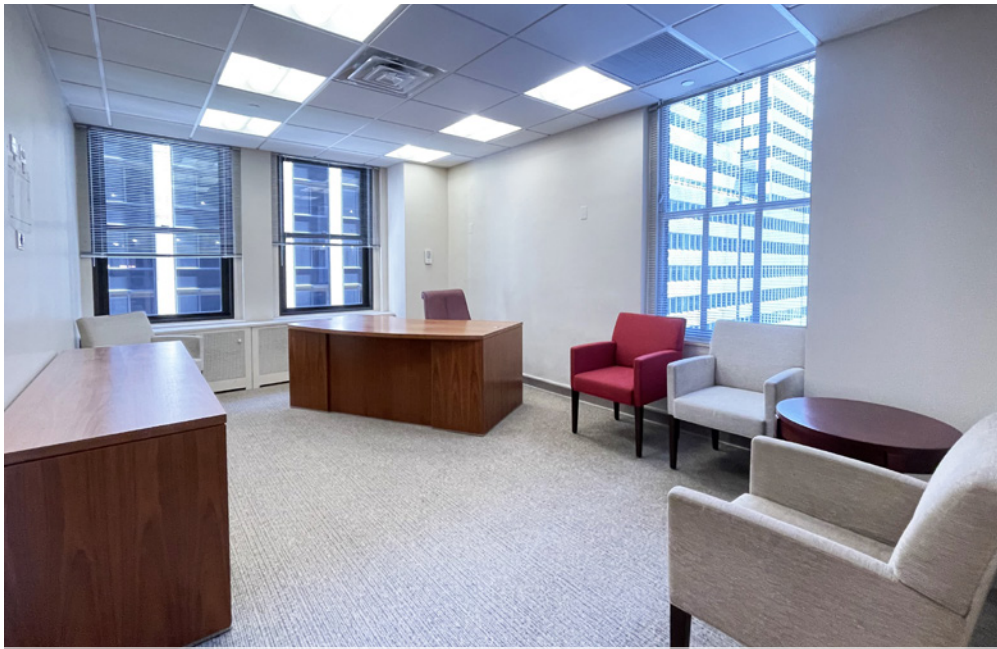
7th Floor - 1,700 RSF Division