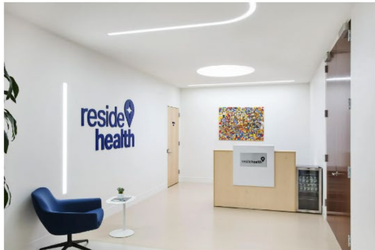
DEDICATED HEALTH & WELLNESS SERVICES