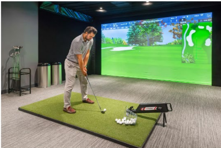
PRIVATE GOLF SIMULATOR