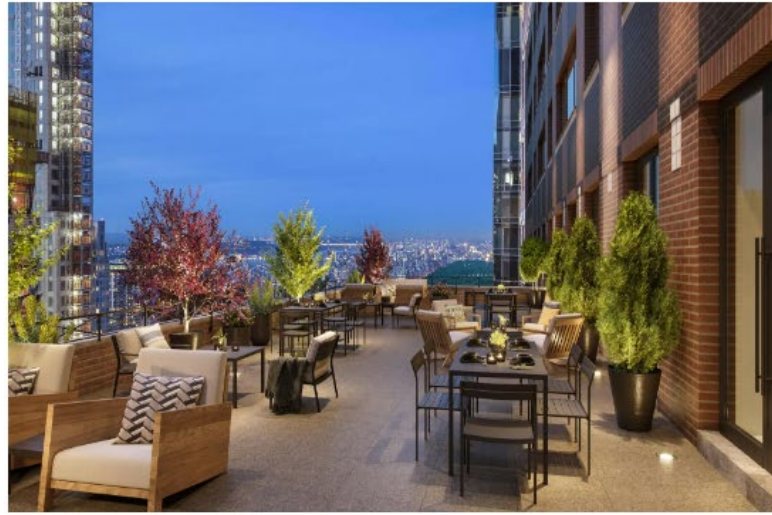
43rd FLOOR BUILDING AMENITY BOARDROOM and TERRACE