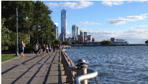
Hudson River Park