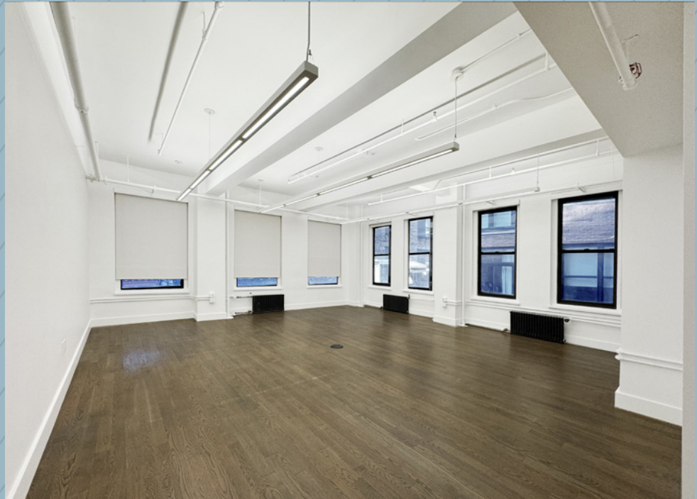
Oversized Conference Room