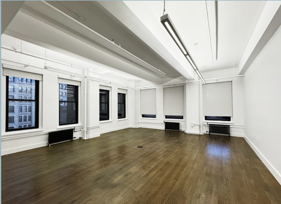
Large collaboration / presentation room