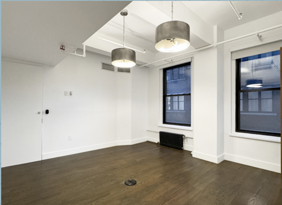
Private Office/Multi-staff Workspace