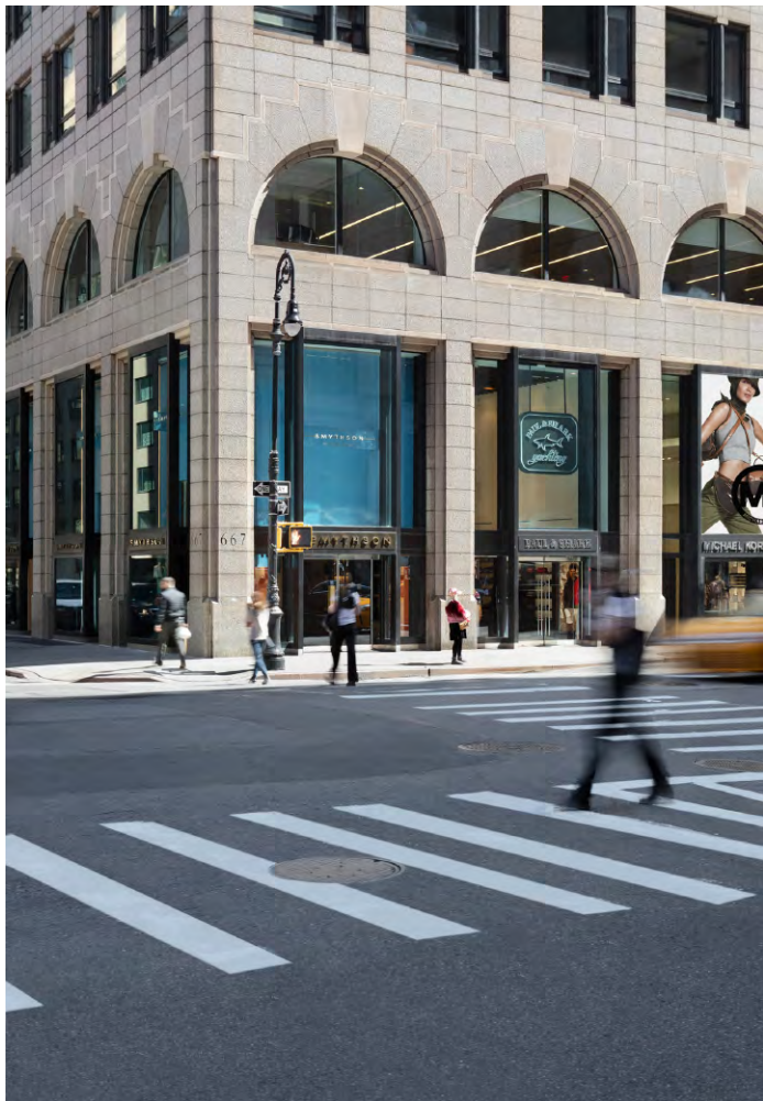
Corner of Madison Avenue and 61st Street