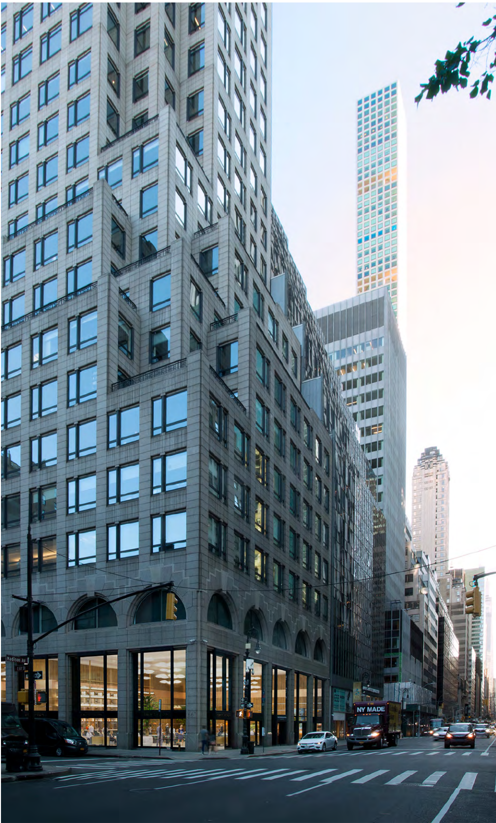
Building Northwest Corner