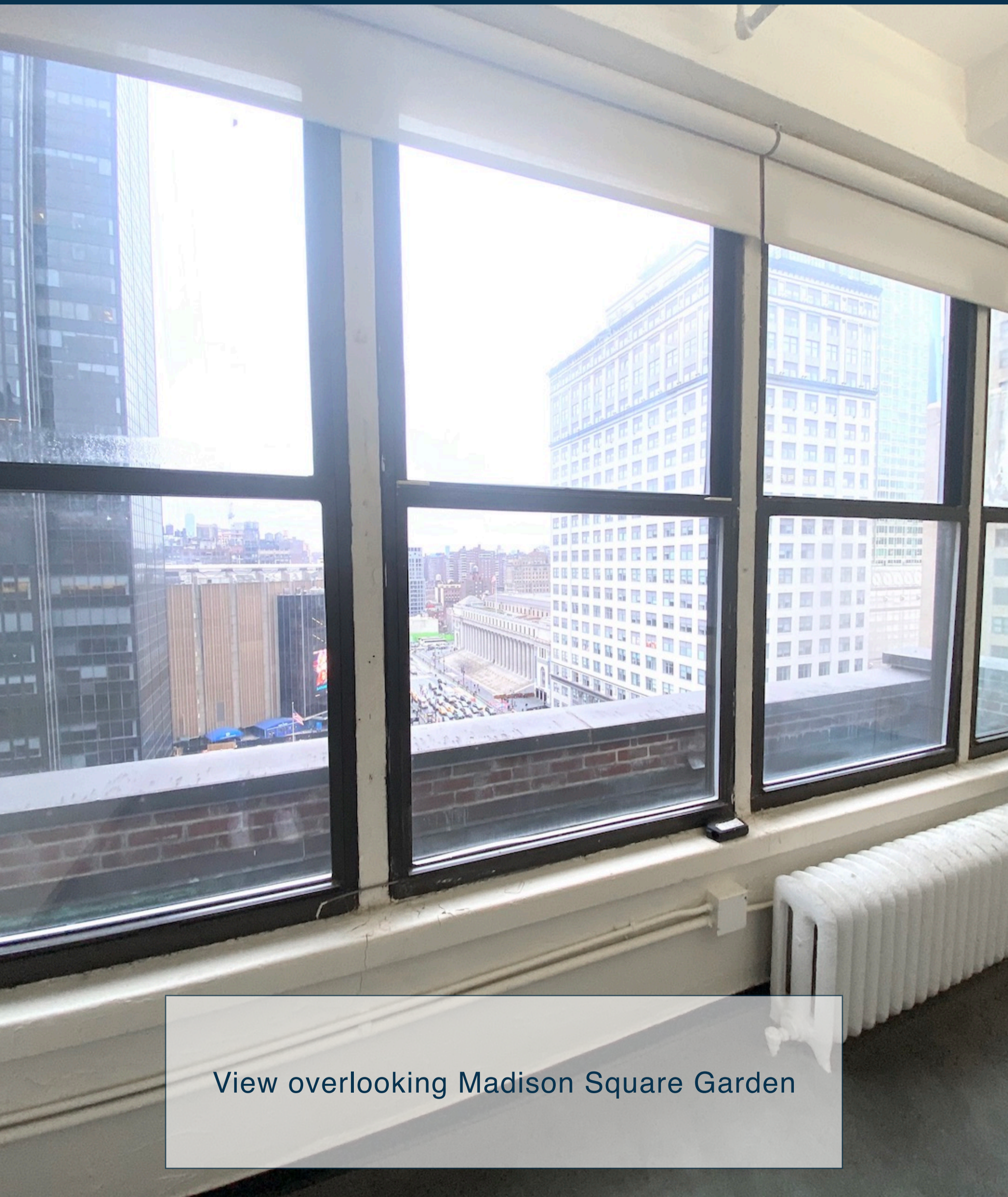
View overlooking Madison Square Garden