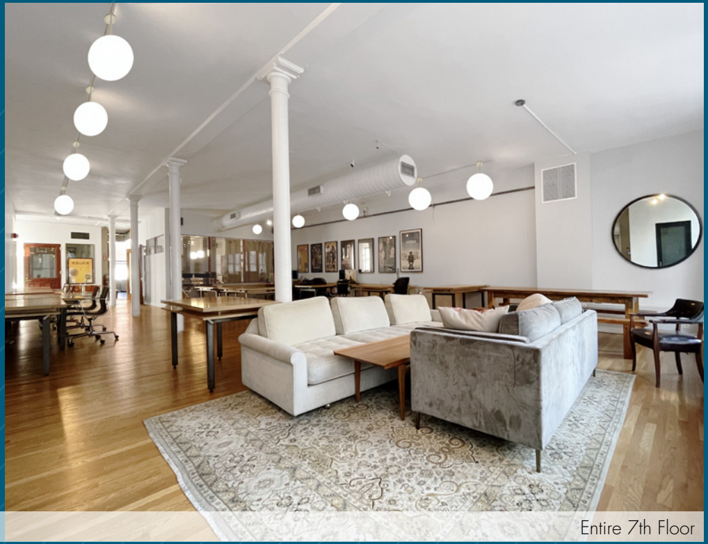
Entire 7th Floor