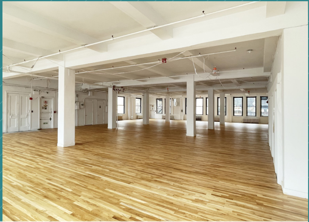
Entire 16th Floor - Existing Conditions