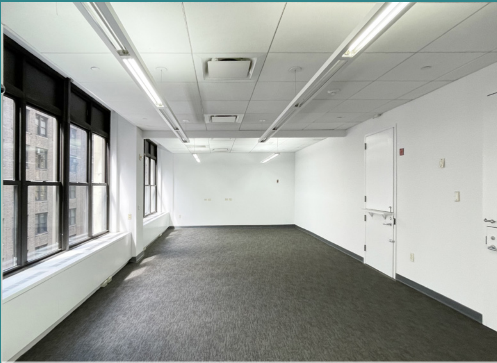
Entire 7th Floor - Conference Room