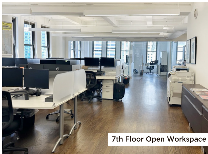
7th Floor Open Workspace