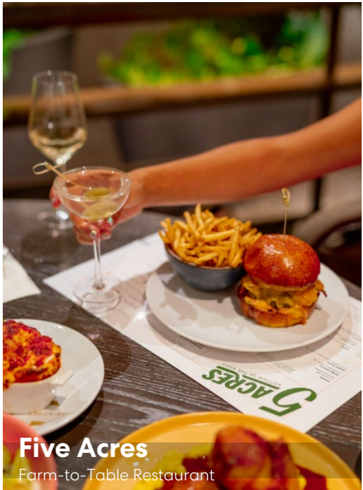
Five Acres Farm-to-Table Restaurant