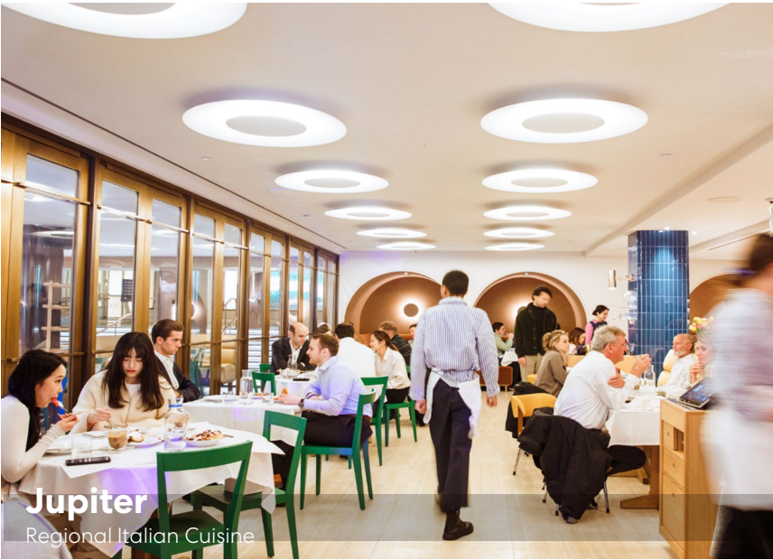
Jupiter Regional Italian Cuisine