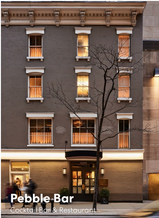
Pebble Bar Cocktail Bar & Restaurant