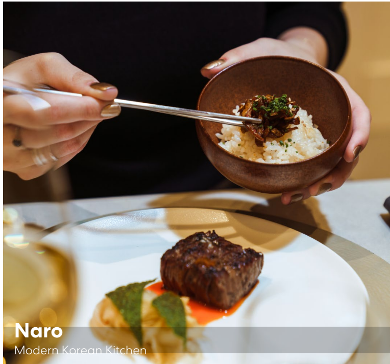
Naro Modern Korean Kitchen