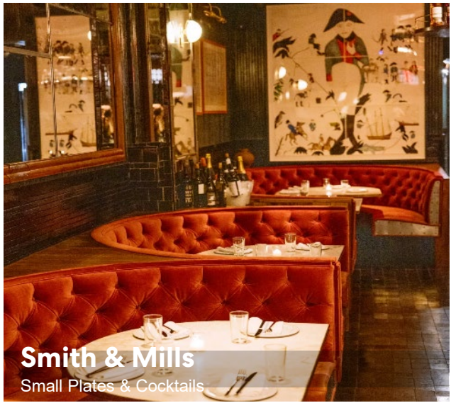
Smith & Mills Small Plates & Cocktails