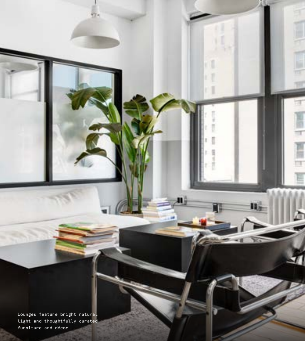
Lounges feature bright natural light and thoughtfully curated furniture and décor.