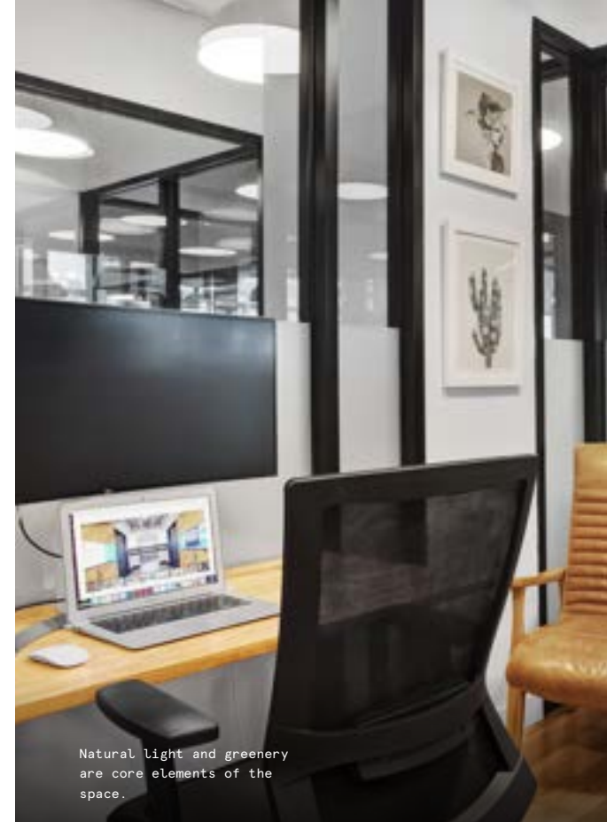
Natural light and greenery are core elements of the space.