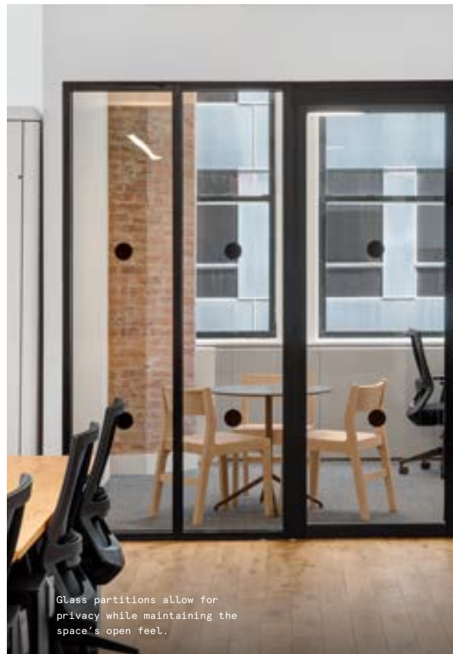
Glass partitions allow for privacy while maintaining the space's open feel.