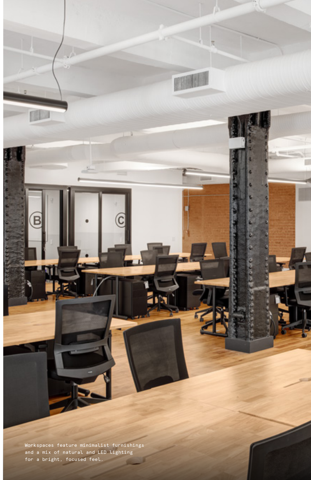
Workspaces feature minimalist furnishings and a mix of natural and LED lighting for a bright, focused feel.