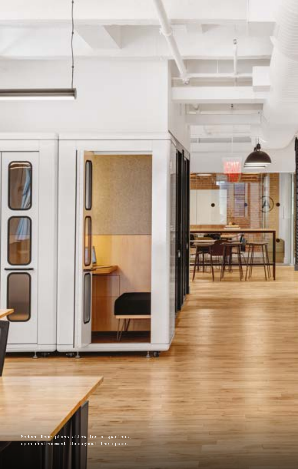
Modern floor plans allow for a spacious, open environment throughout the space.