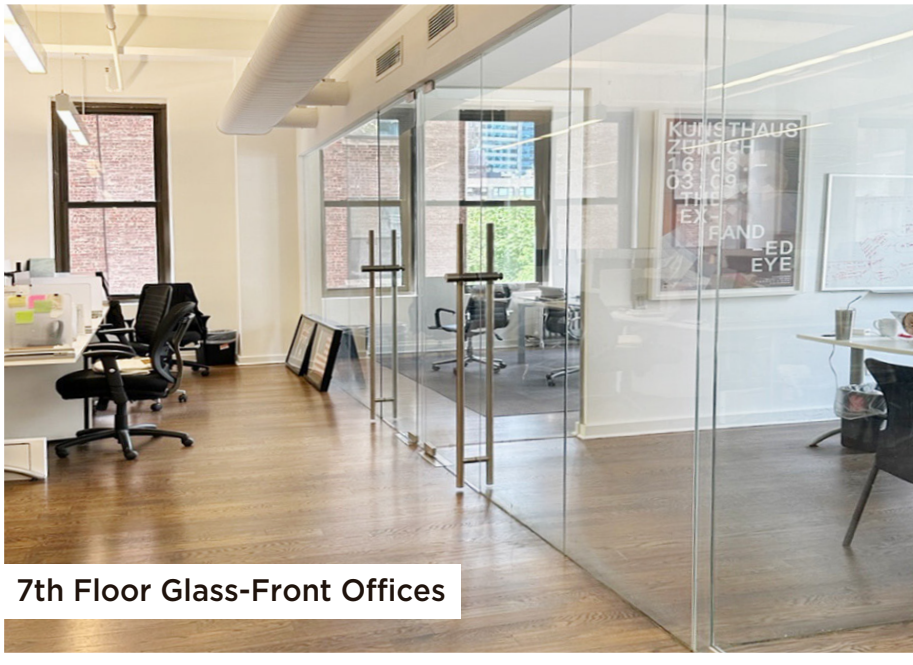
7th Floor Glass-Front Offices