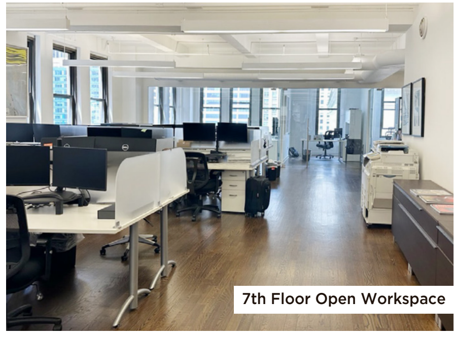
7th Floor Open Workspace