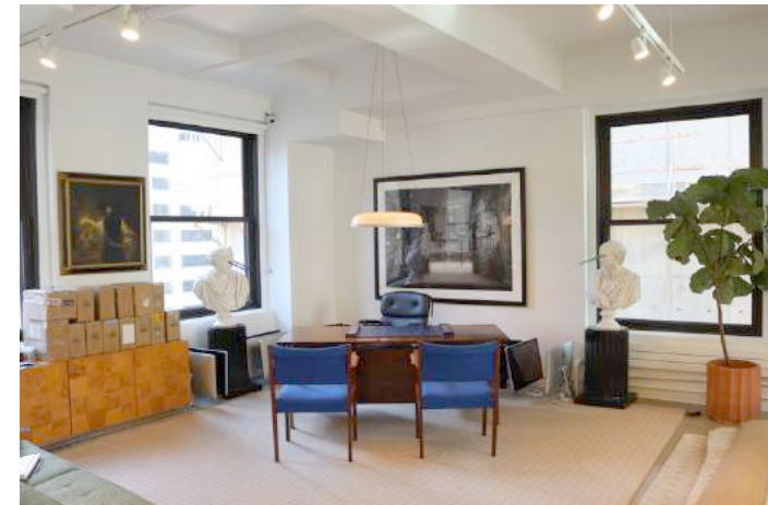
22nd Floor Creative Installation