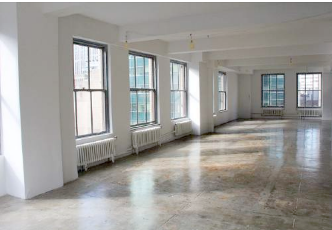
15th Floor Whitebox