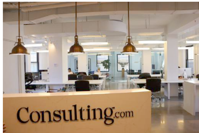
22nd Floor Creative Installation