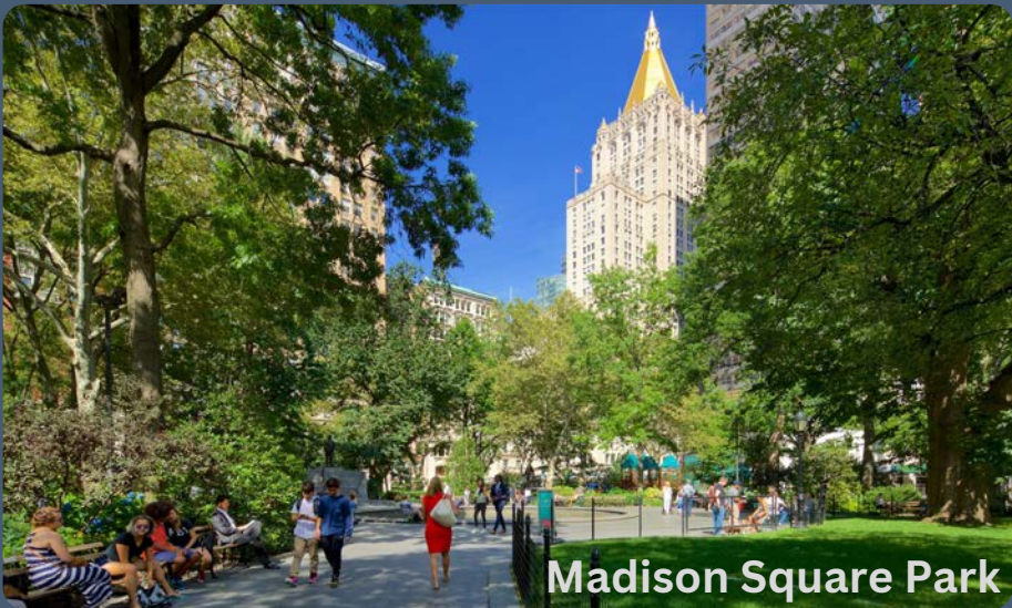
Madison Square Park

Companies considering a move to 115 West 27th Street have the luxury of being close to many central subways. When you work here, getting to other parts of the city and outer boroughs is easy. The building is uniquely positioned with seamless accessibility from Herald Square (access to B, D, F, M, N, Q, R, W and the PATH) and Penn Station (access to 1, 2, 3, A, C, E, 7, LIRR and New Jersey Transit).