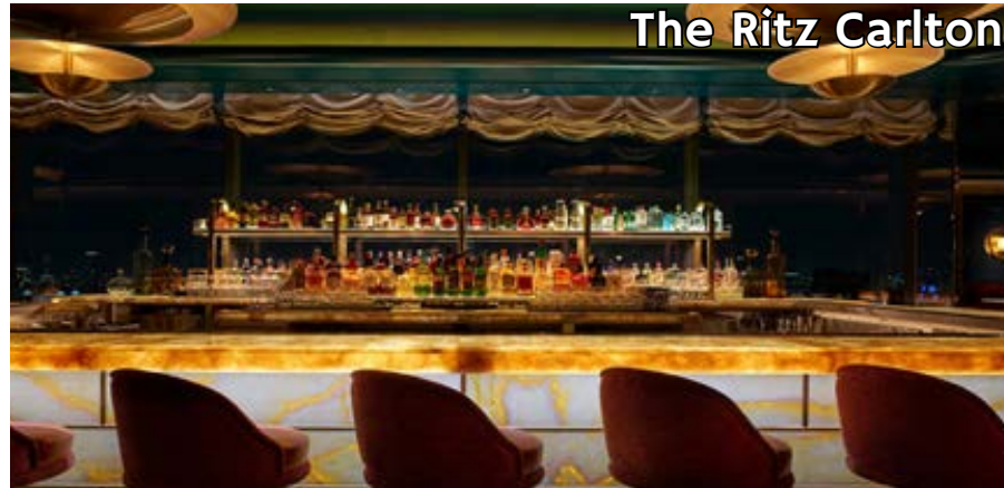
The Ritz Carlton