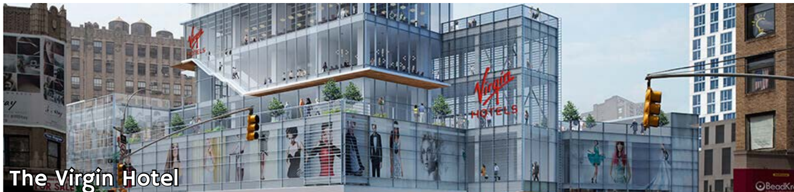
The Virgin Hotel