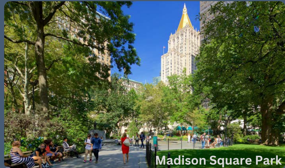
Madison Square Park

Companies considering a move to 115 West 27th Street have the luxury of being close to many central subways. When you work here, getting to other parts of the city and outer boroughs is easy. The building is uniquely positioned with seamless accessibility from Herald Square (access to B, D, F, M, N, Q, R, W and the PATH) and Penn Station (access to 1, 2, 3, A, C, E, 7, LIRR and New Jersey Transit).