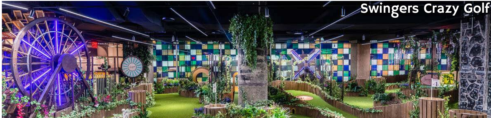
Swingers Crazy Golf