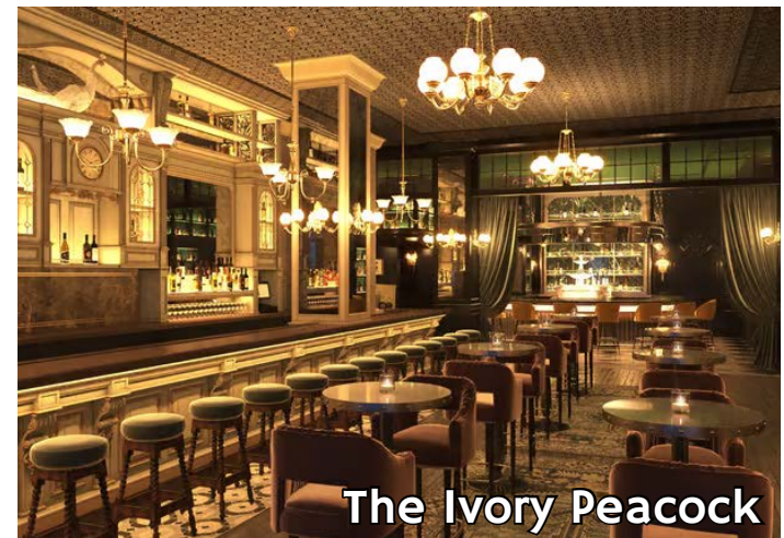
The Ivory Peacock