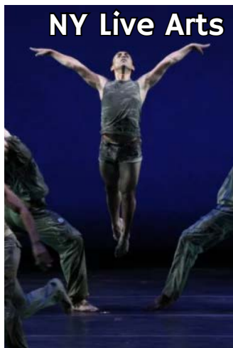
NY Live Arts