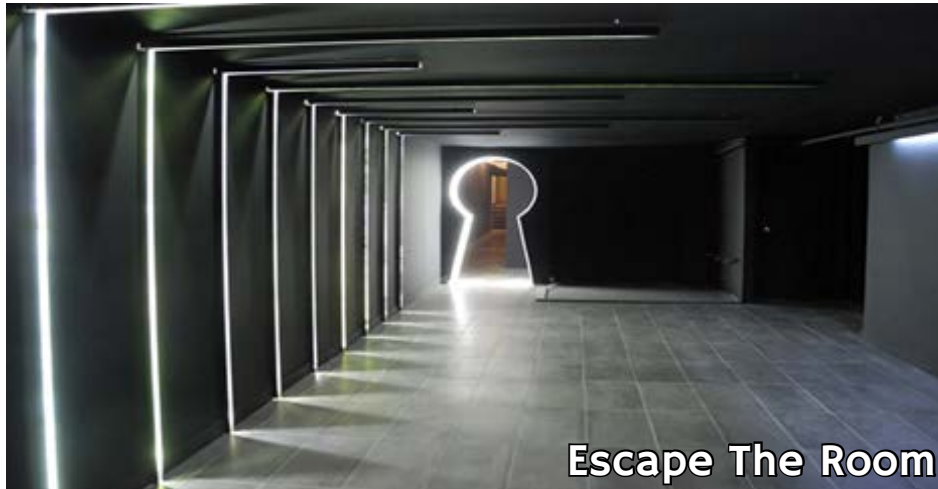
Escape The Room