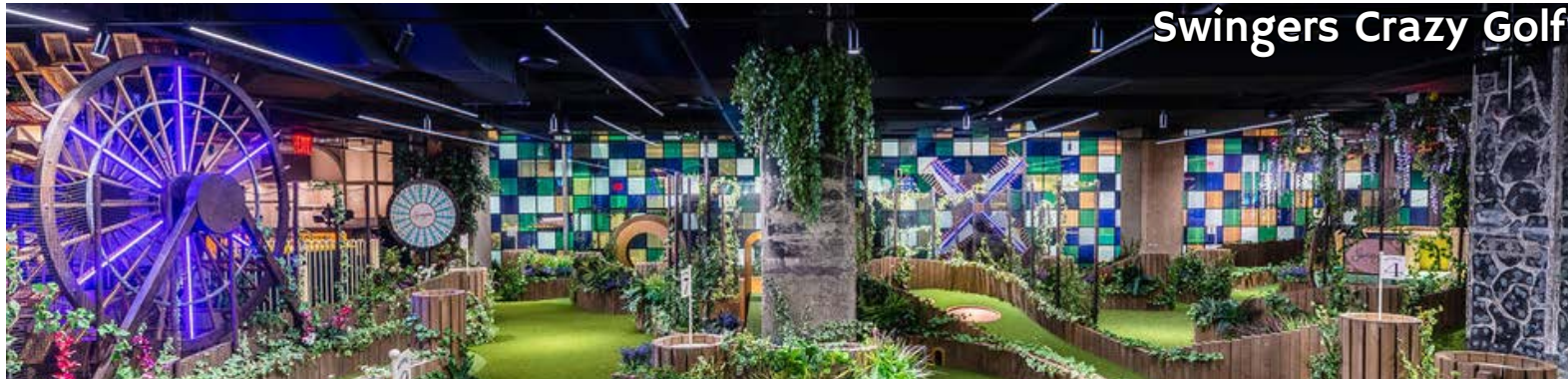
Swingers Crazy Golf