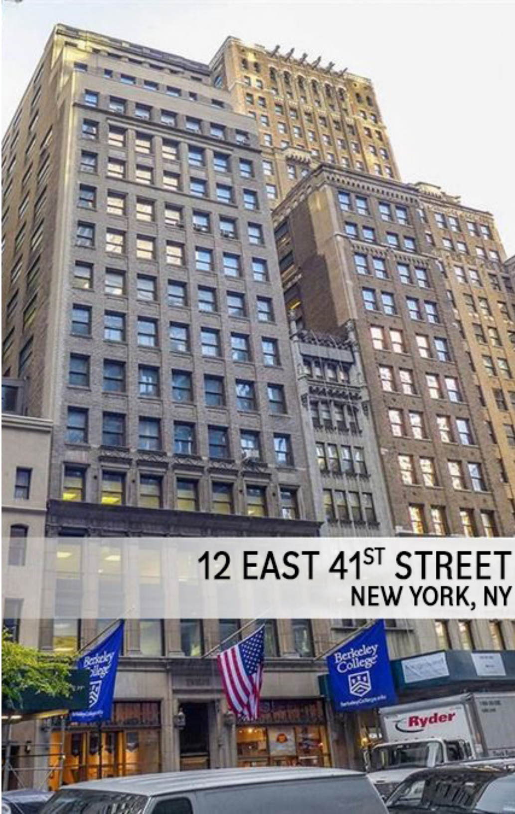
12 EAST 41 ST STREET NEW YORK, NY