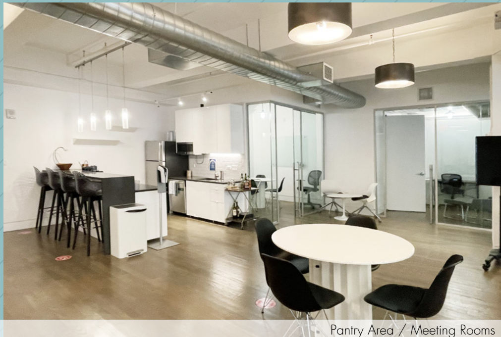
Pantry Area / Meeting Rooms

Suite 802 6,182 rsf Possession: Immediate Rent: Call or email for info