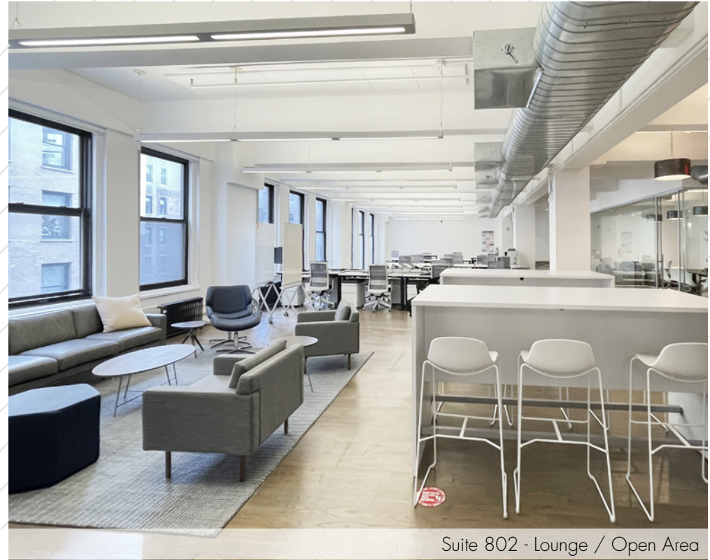
Suite 802 - Lounge / Open Area