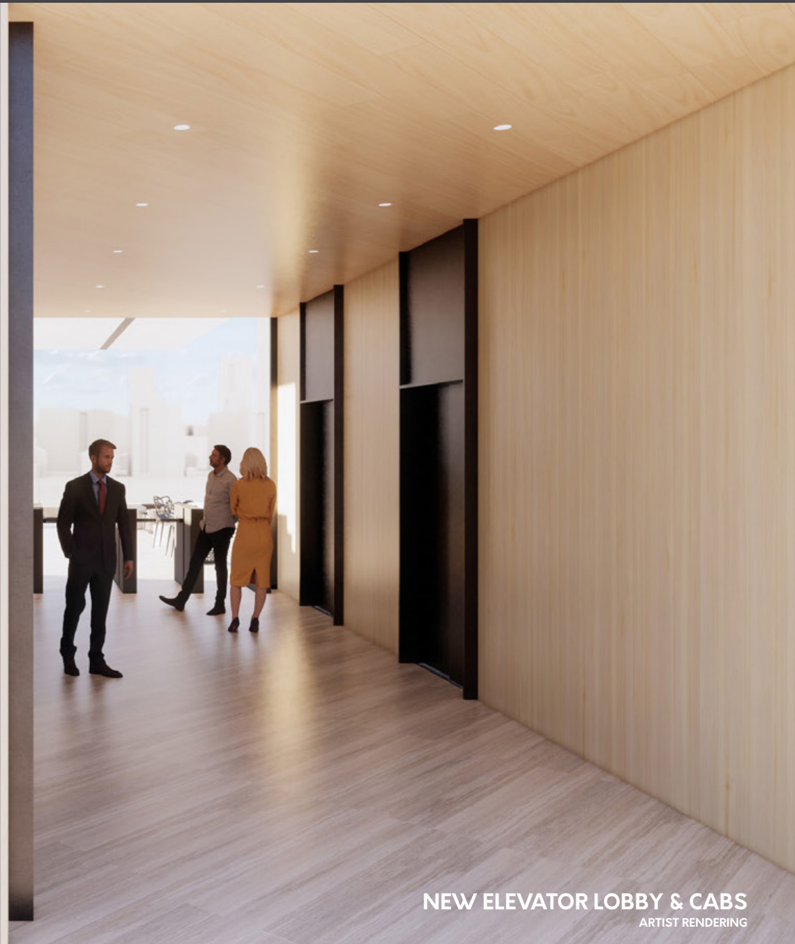
NEW ELEVATOR LOBBY & CABS ARTIST RENDERING