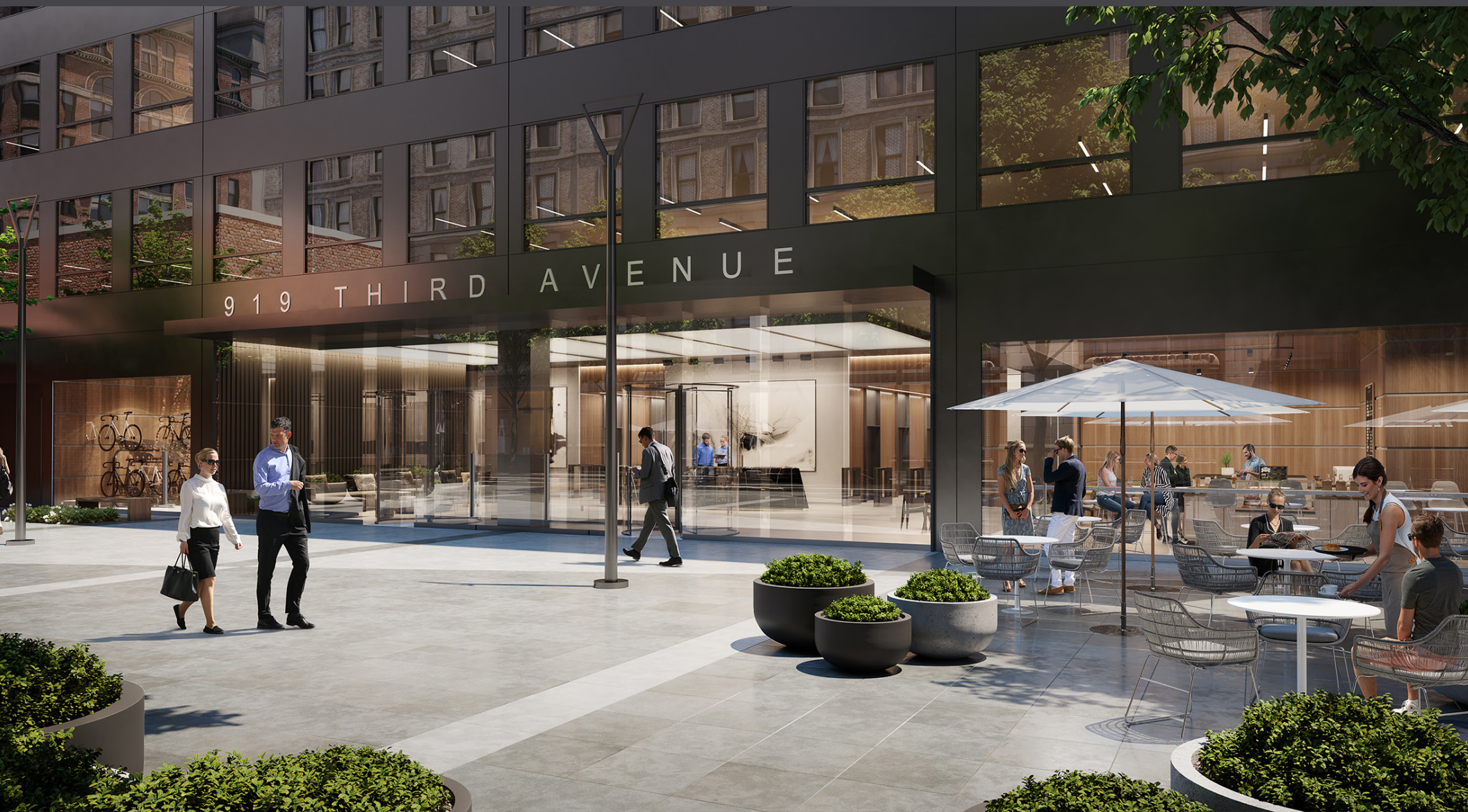
LOBBY EXTERIOR CAFE & BIKE ROOM ARTIST RENDERING