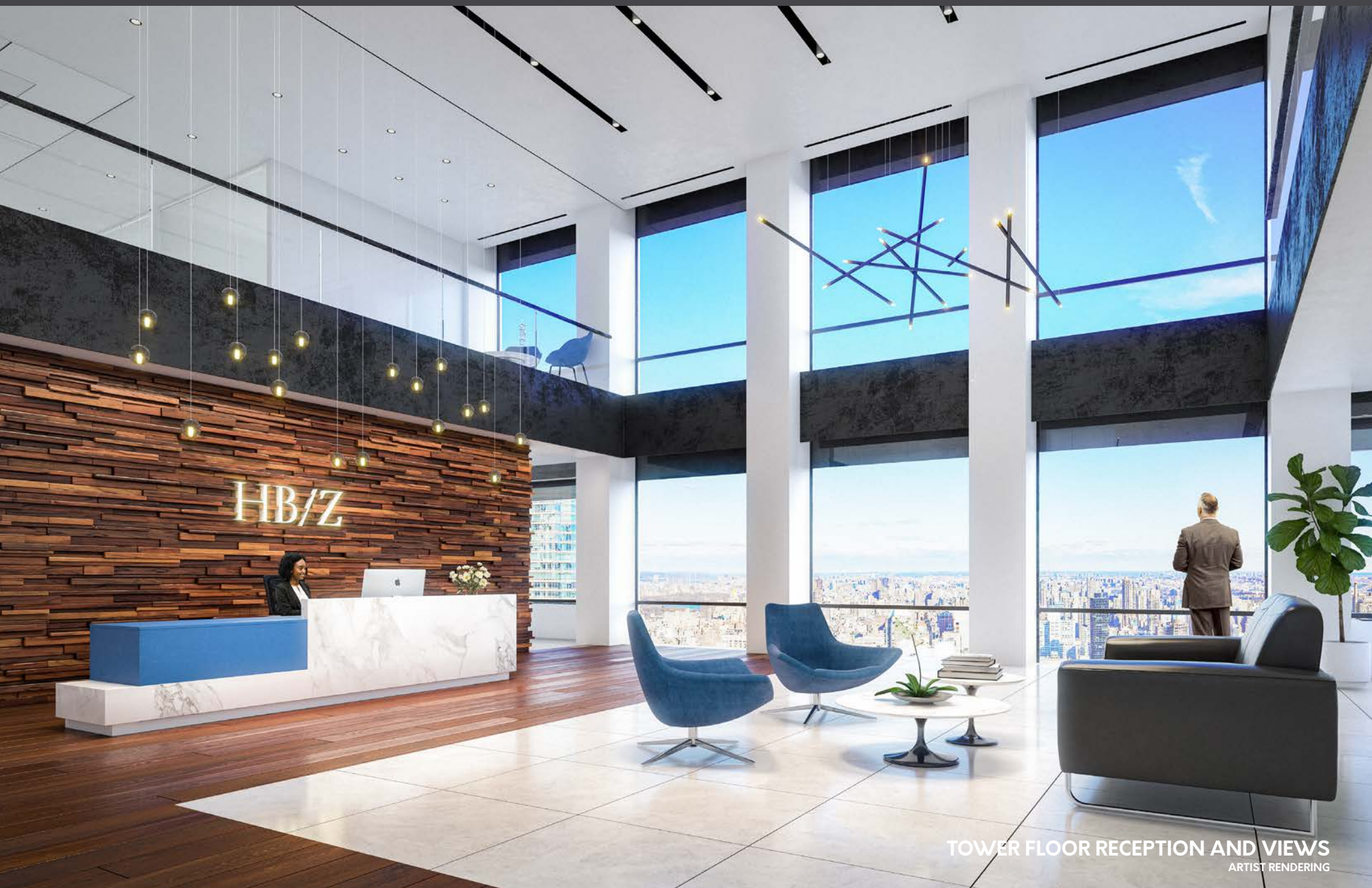
TOWER FLOOR RECEPTION AND VIEWS ARTIST RENDERING