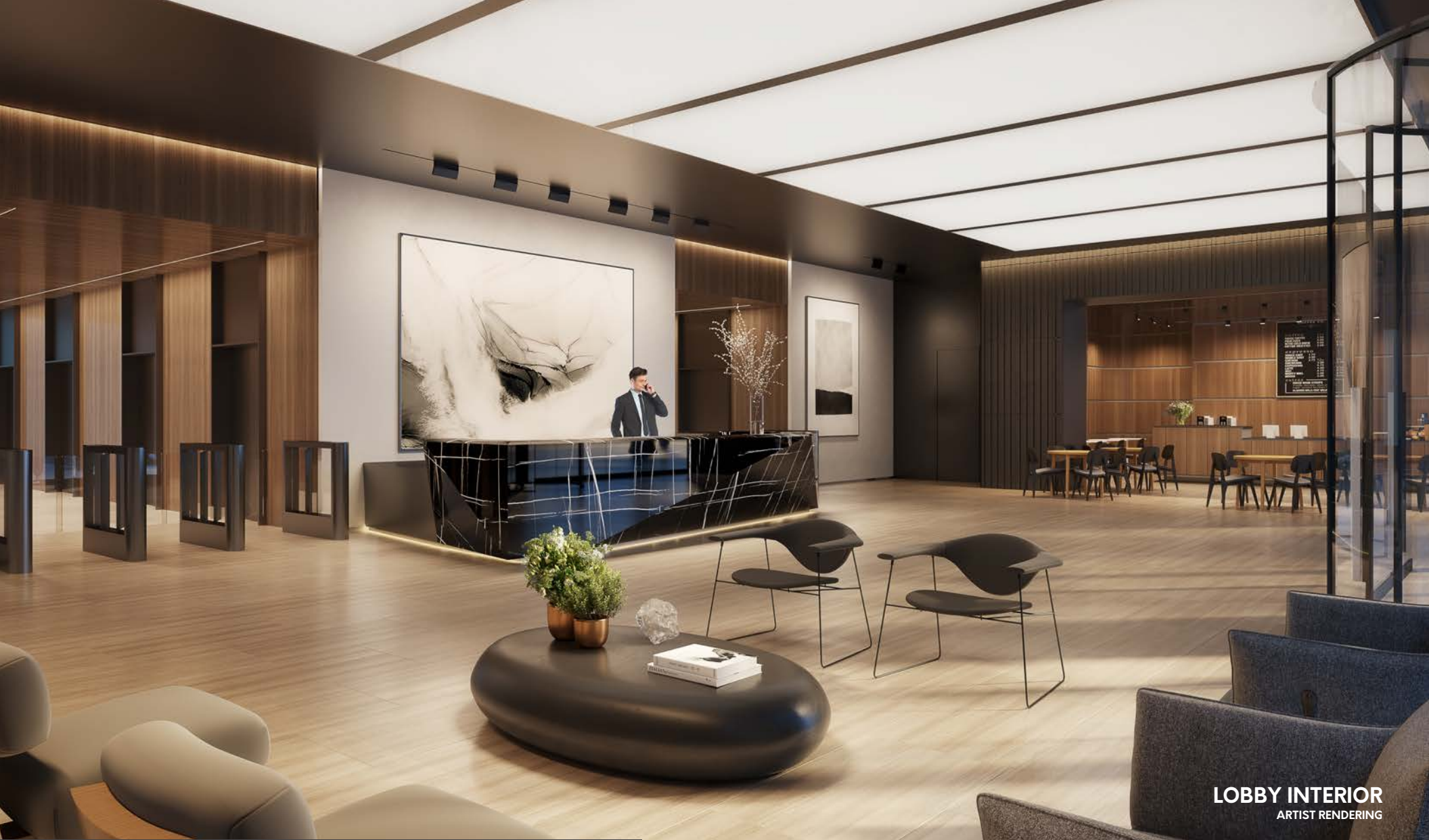
LOBBY INTERIOR ARTIST RENDERING