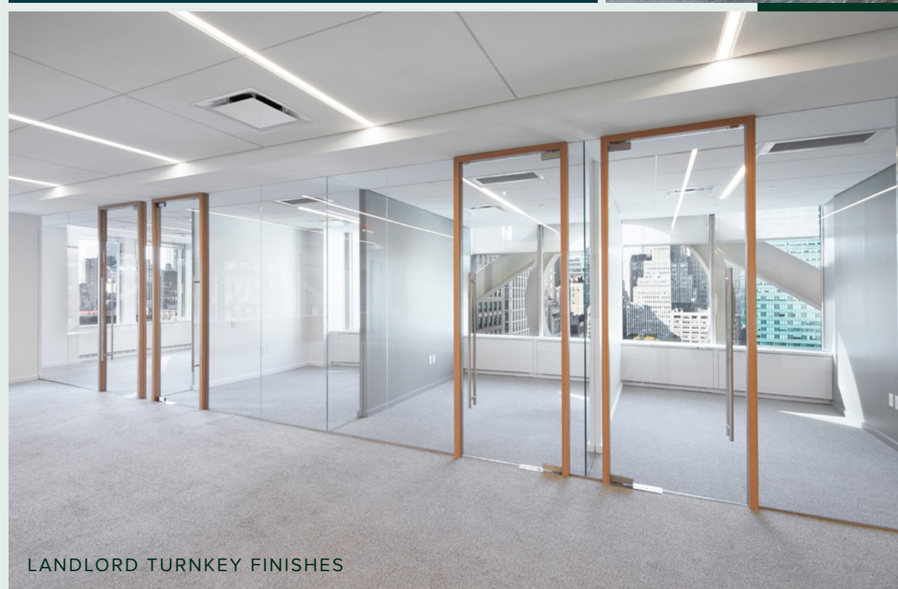
LANDLORD TURNKEY FINISHES