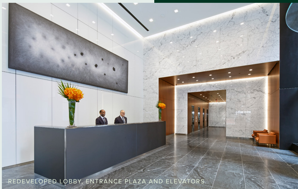
REDEVELOPED LOBBY, ENTRANCE PLAZA AND ELEVATORS

HIGH-END FULL FLOOR PREBUILTS OR LANDLORD TURNKEY IN BOUTIQUE BUILDING DIRECTLY ACROSS FROM BRYANT PARK