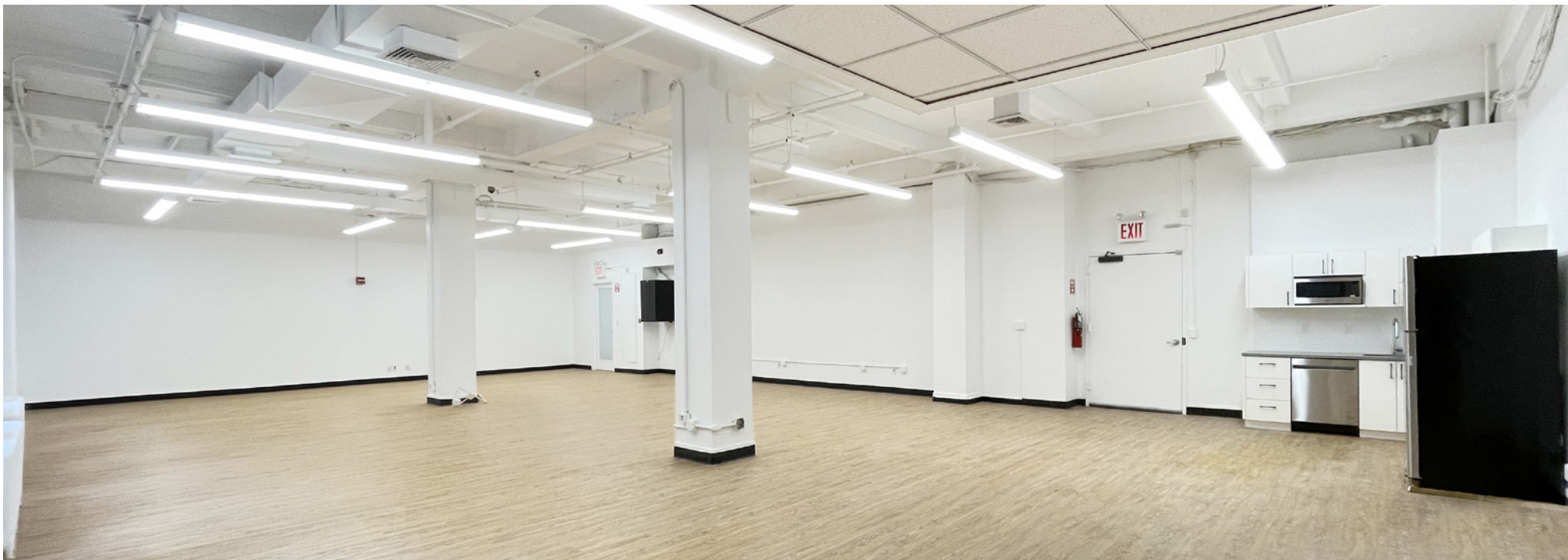
Suite 302 - Existing Conditions