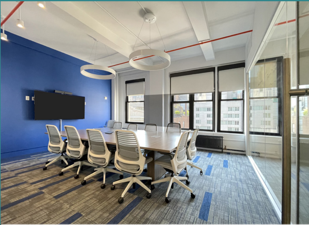
Entire 14th Floor - Conference Room