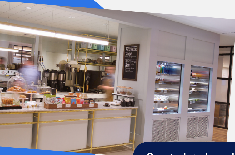
Curated grab-and-go food service