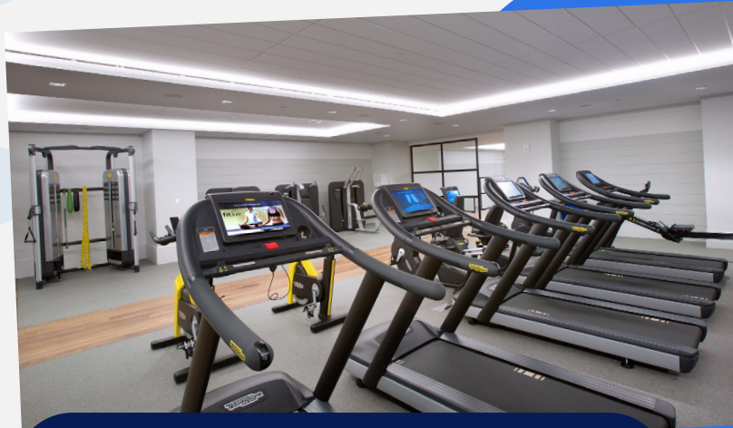
Fitness center with locker rooms/executive laundry and wellness programming