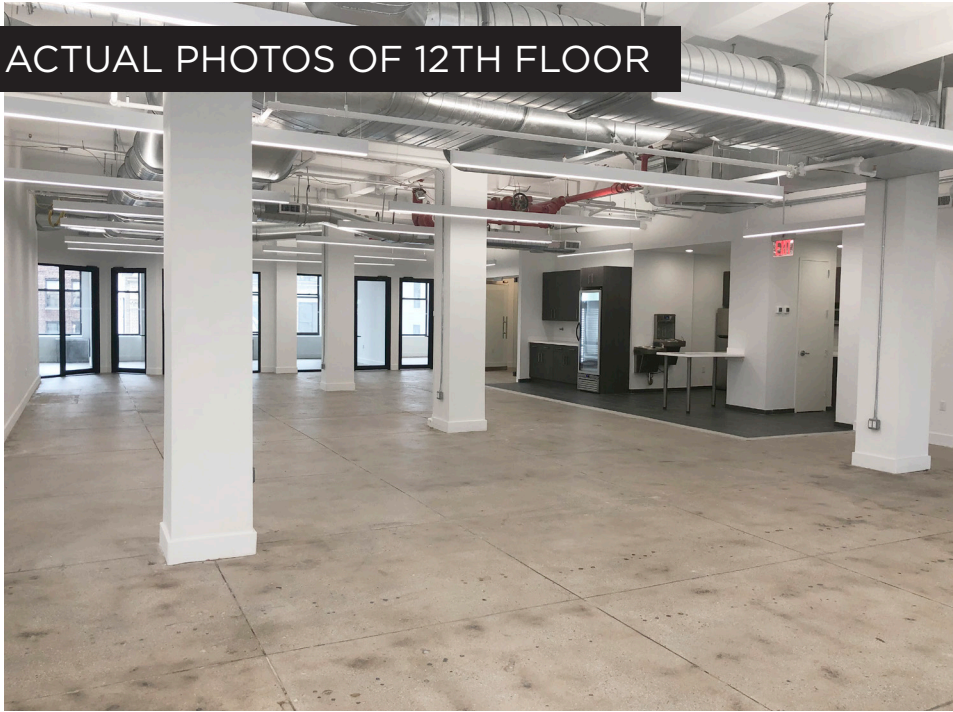
ACTUAL PHOTOS OF 12TH FLOOR