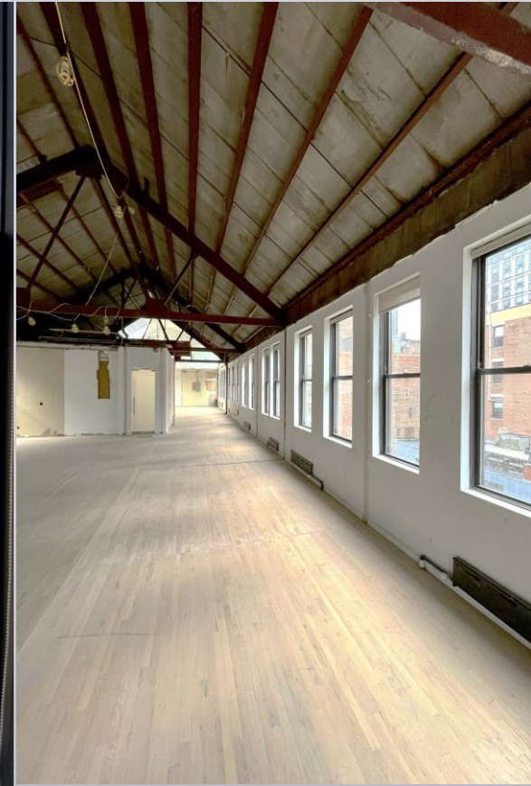
PH PARTIAL FLOOR 11

Unveiled- Prime Location 276 5 th Avenue