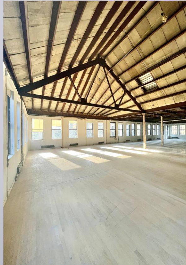
PH PARTIAL FLOOR 11

One of a kind top floor opportunity with light and views on all sides Ultra creative with wood flooring Exceptional ceiling heights Brand Identity Skylights Ready to be re-imagined May Divide Organic growth opportunity