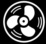
MODERNIZED HVAC PLANT