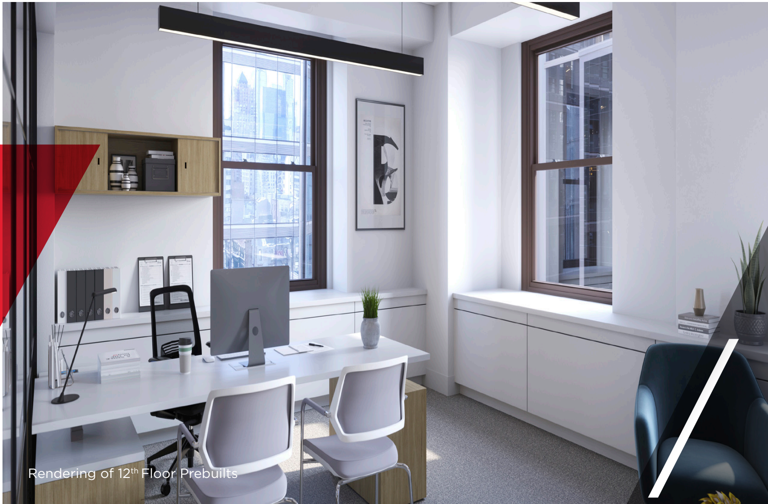
Rendering of 12 th Floor Prebuilts