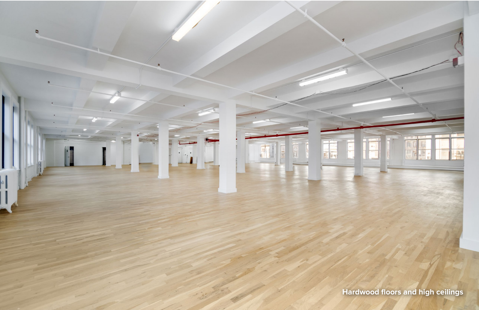
Hardwood floors and high ceilings