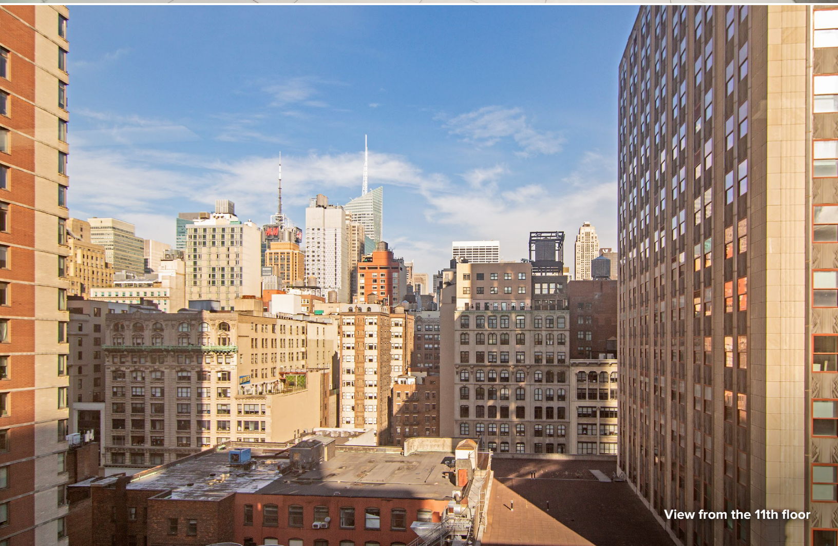
View from the 11th floor