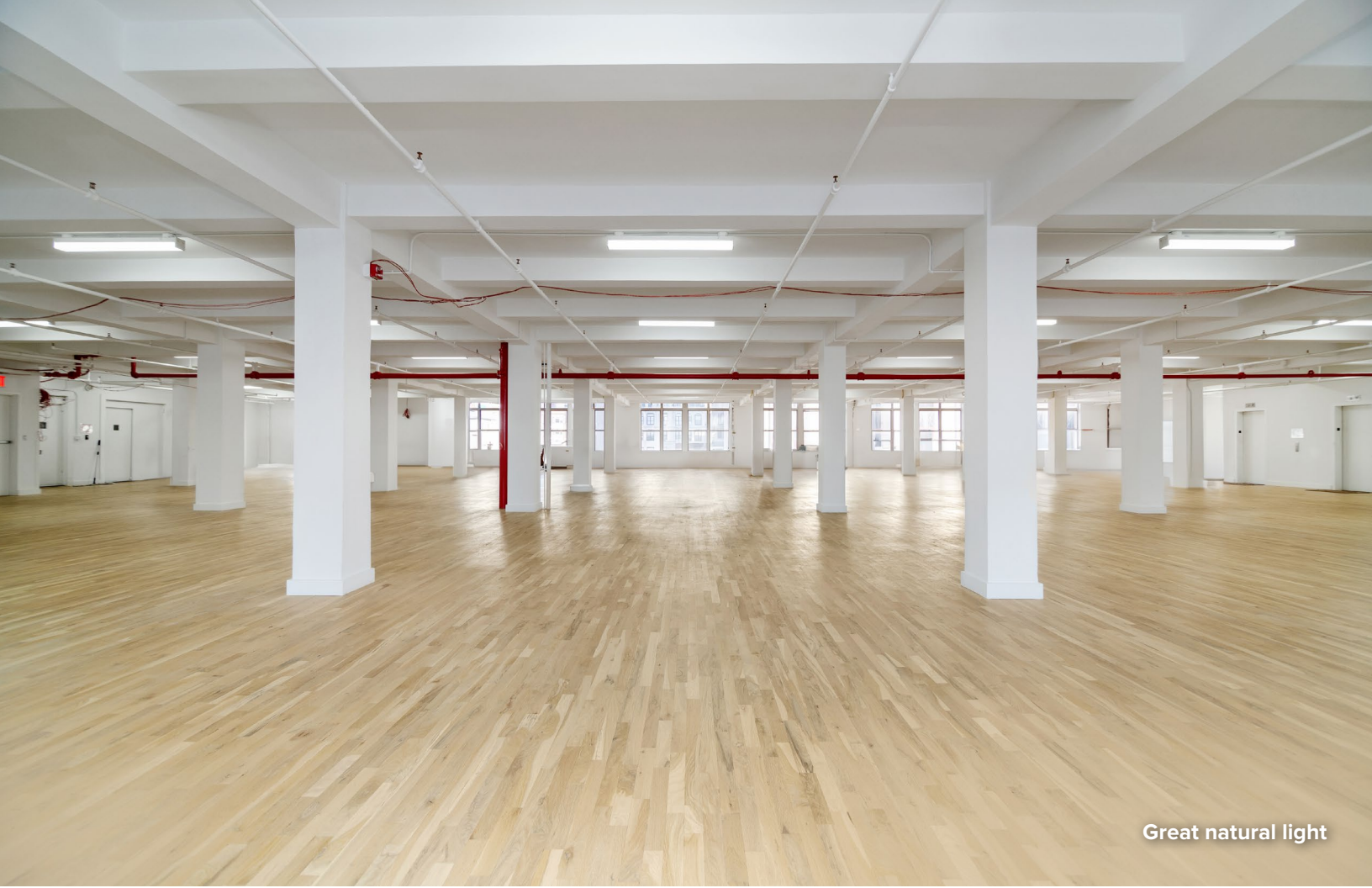
Great natural light