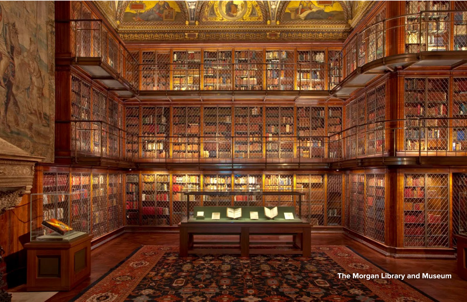
The Morgan Library and Museum