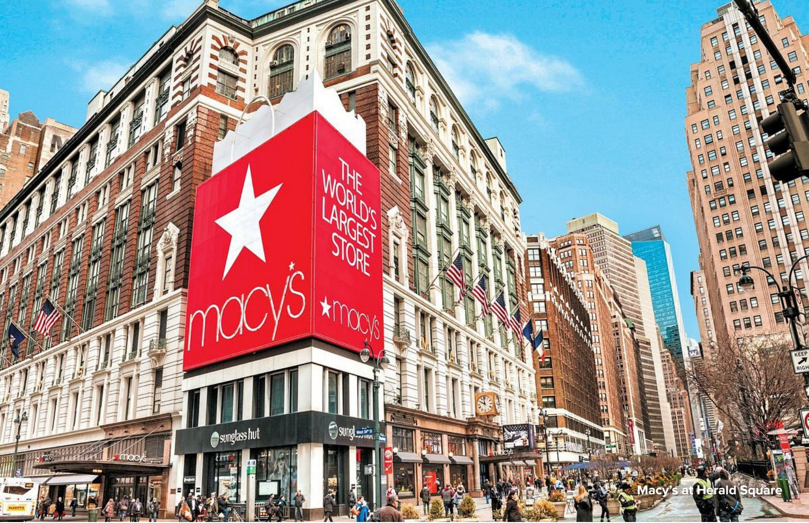
Macy's at Herald Square