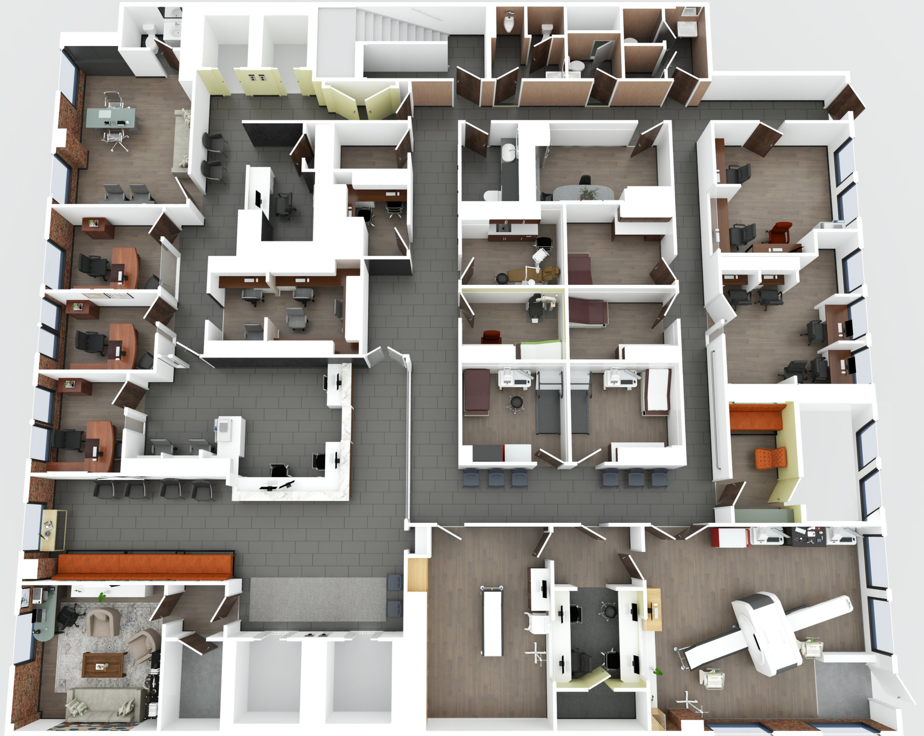
FLOOR PLAN FOR ILLUSTRATIVE PURPOSES ONLY