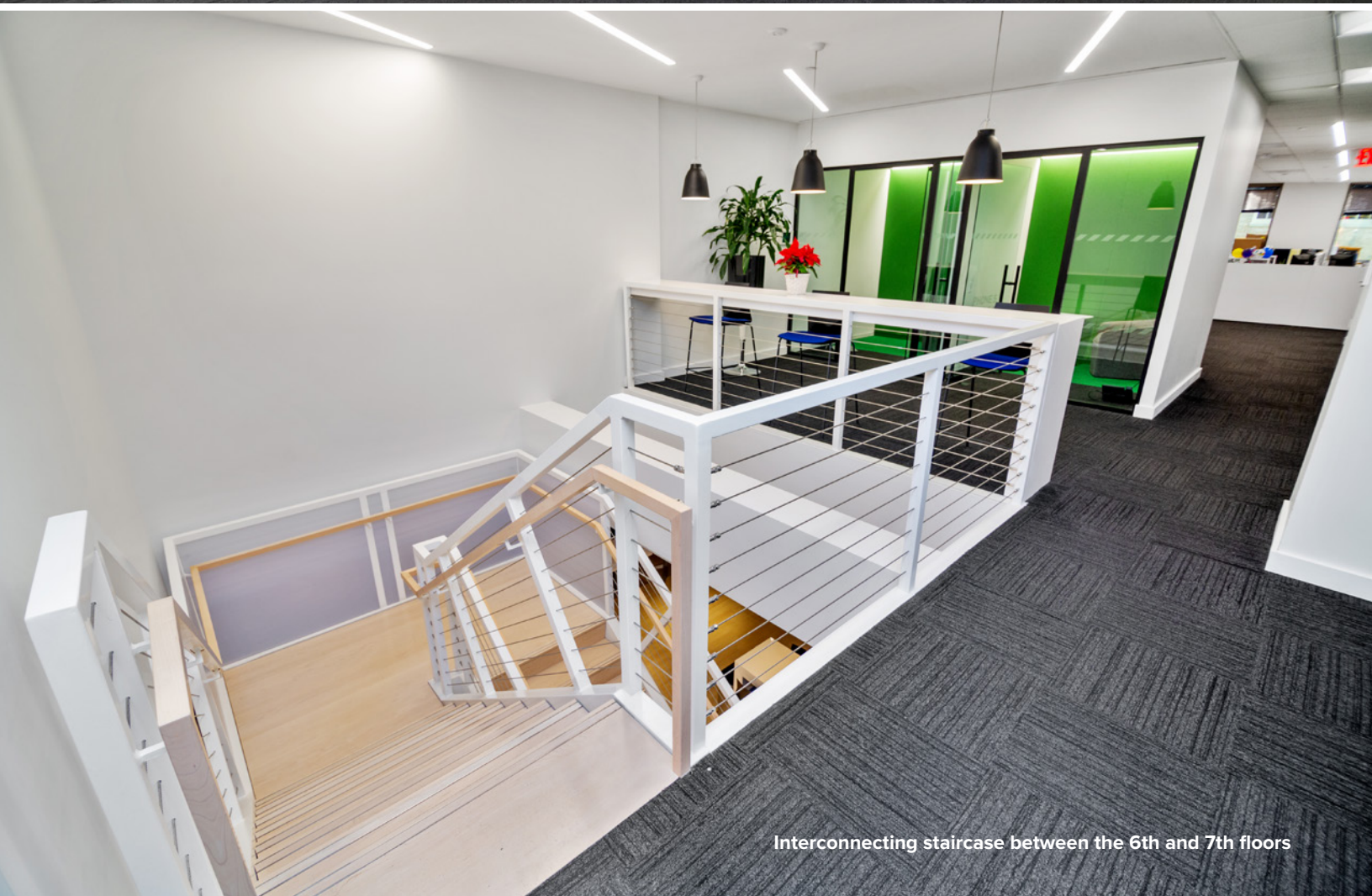
Interconnecting staircase between the 6th and 7th floors