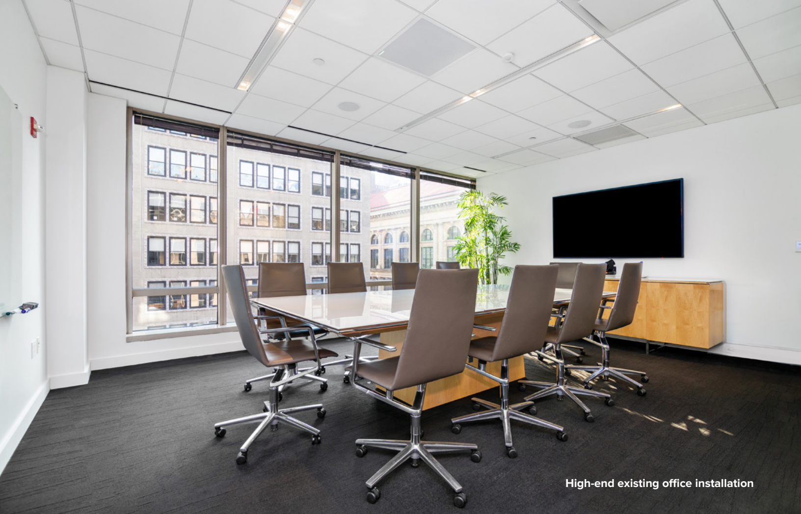
High-end existing office installation