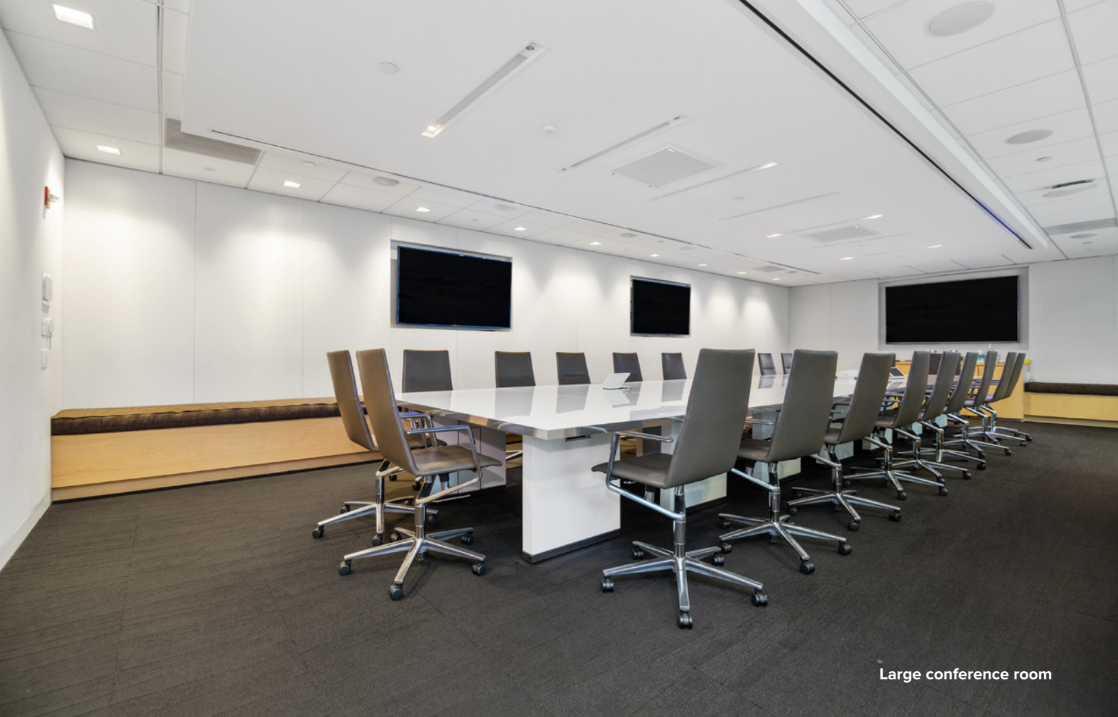
Large conference room