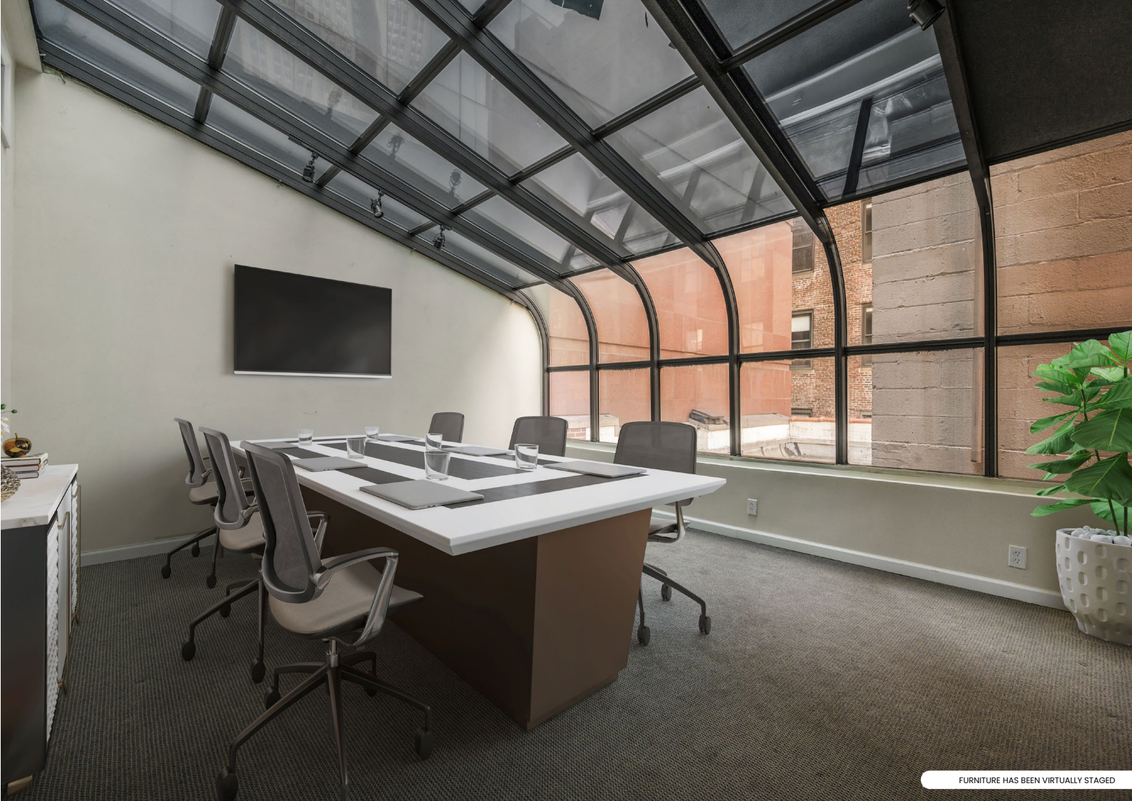
FURNITURE HAS BEEN VIRTUALLY STAGED