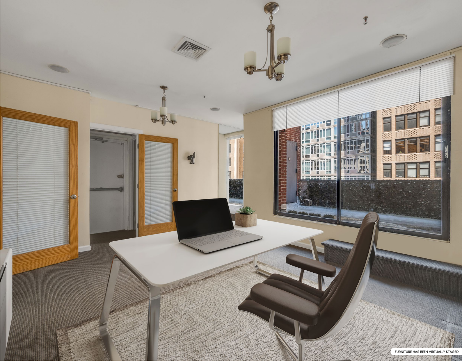
FURNITURE HAS BEEN VIRTUALLY STAGED